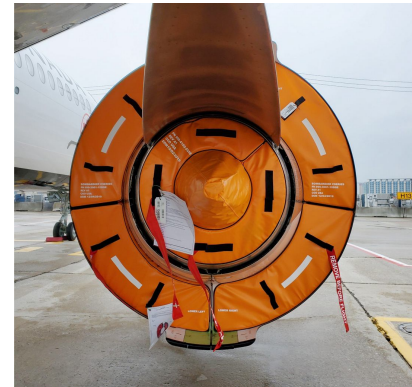
Airbus A320 Exhaust & Bypass Vent Plugs