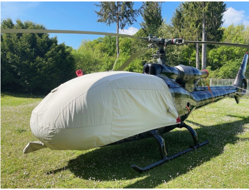
Aerospatiale Gazelle Bubble Cover