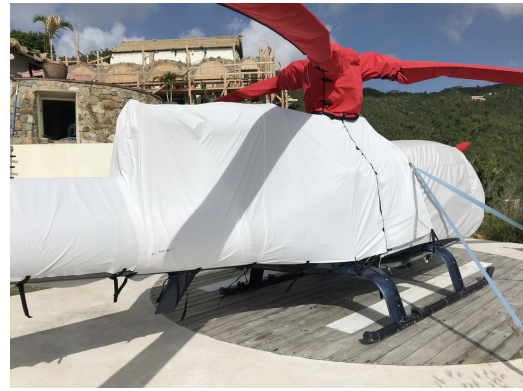
Aerospatiale Gazelle AS341 Bubble, Rotor Mast, Blade, Engine & Tailboom Covers (some are test fit covers)