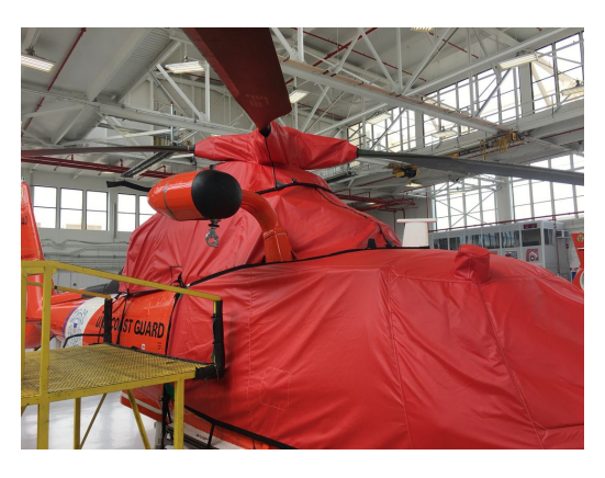
U.S. Coast Guard HH-65 Dolphin Bubble, Engine & Rotor Mast Covers