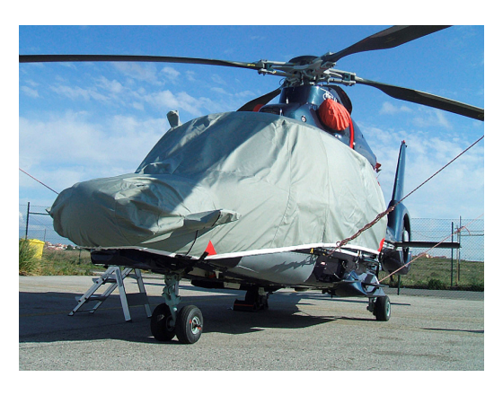
Dauphin Bubble Cover, extended nose

Travel Covers are made with Silver Solution-Dyed Polyester fabric and fully lined over the entire cover. The material is lightweight and more compact for easy stowage in the aircraft. The polyester material is water resistant, but only intended for occasional use outside. We also have an ultra lightweight material available for fitted hangar dust covers. For daily outdoor use, the non-travel Sunbrella Cover is the best choice.