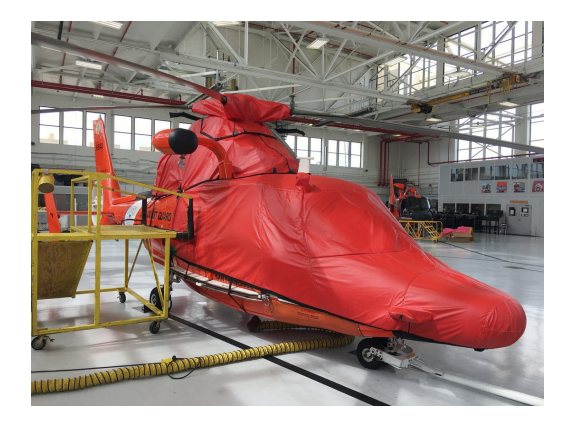
U.S. Coast Guard HH-65 Dolphin Bubble, Engine & Rotor Mast Covers