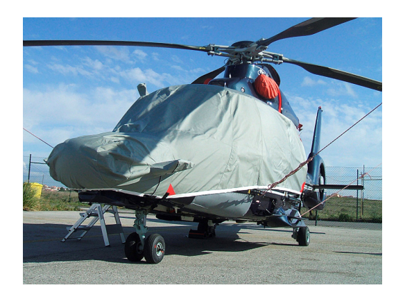
Dauphin Bubble Cover, extended nose

This cover type is made from Silver Acrylic Sunbrella canvas and is 100% lined with a soft and smooth microfiber. Bruce's Custom Covers developed this material combination especially for aircraft protection. The outer material is medium weight and treated for water resistance, UV resistance and anti-static buildup. The inner lining is a very soft and smooth microfiber to prevent scratching. The material is very reflective, and tests show that the cabin interior temperature can be reduced to near-ambient temperature on the hottest of days. It is water, ice and snow repellent, yet breathable to allow moisture to escape from between the cover and the aircraft surface.