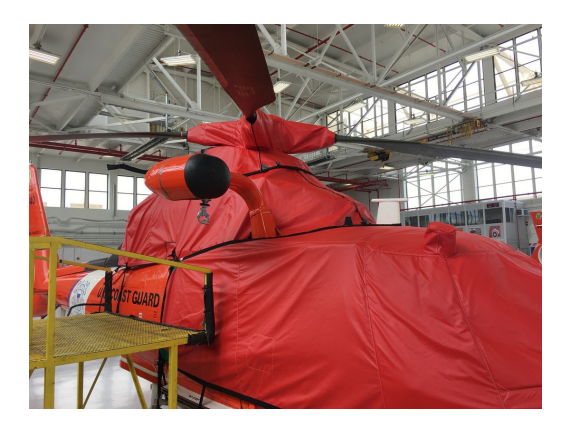
U.S. Coast Guard HH-65 Dolphin Bubble, Engine & Rotor Mast U.S. Coast Guard HH-65 Dolphin Bubble, Engine & Rotor Mast Covers