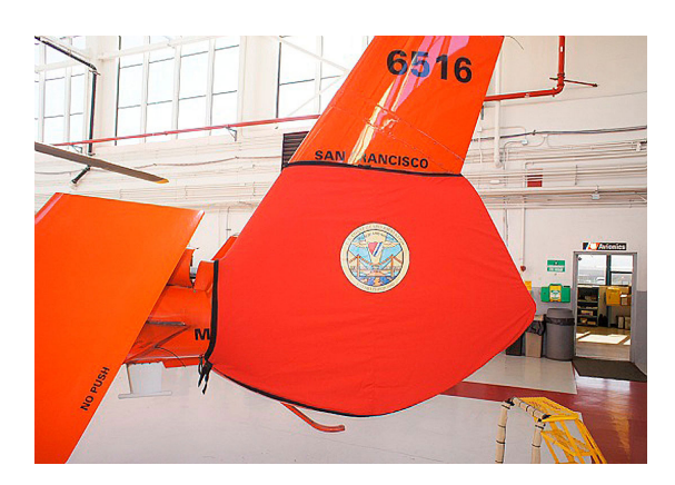
MH-365C Dauphin Tail Fan Fenestron Cover

The Tailboom Cover details vary by model, but generally the helicopter tail boom cover encloses the tail boom from the "bottleneck" to the aft end. They usually also cover the horizontal stabilizers, and are custom made to allow for antennae, lights, and other protrusions. They attach with straps underneath the tail boom. Covers for the vertical and horizontal stabilizers are also available separately. Specific information for each model is available on request.