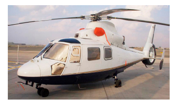
Dauphin HeatShield Set

foam with a silver mylar finish. The semi-rigid design is stiff enough to stand along the inside of the windshield using sun visors or window framing. It folds up flat and easily stores in the included storage sleeve. Some designs may require velcro and suction cups. A Heatshield is an excellent short-term remedy for cockpit overheating.