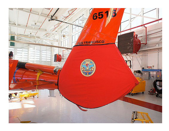
MH-365C Dauphin Tail Fan Fenestron Cover