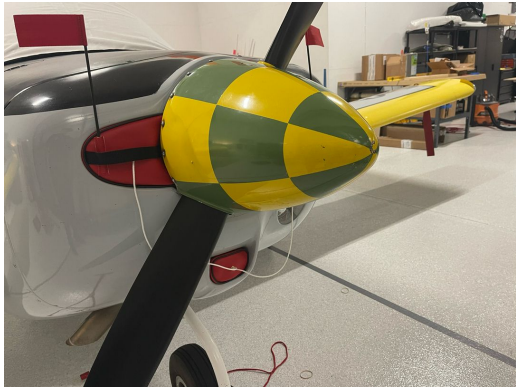
Grumman AA-1B Engine Inlet Plugs (set of 3)

and dried if necessary. Engine plugs have warning flags that are visible from the cockpit or 'remove before flight' streamers sewn onto the face of the plugs. Most plugs are imprinted with the aircraft registration number in black for an extra charge. Storage bag NOT included. Engine plugs may be inserted after flight when the engine is still warm. Engine Inlet Plugs are commonly referred to as Cowl Plugs, Intake Plugs, Cowl Blocks, Engine Blocks, and Engine Bungs.