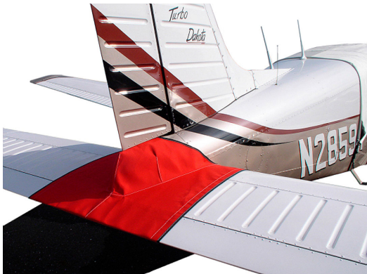
Piper PA-28 Tailcone Cover

WINTER USE MATERIAL - Made with Solution-Dyed Polyester fabric, this option is intended for seasonal use to aid in deicing, rain mitigation, or for occasional travel. The material is lighter and more compact, but more susceptible to UV damage and may have a shorter useful life if used continuously outside than the all-year use material.