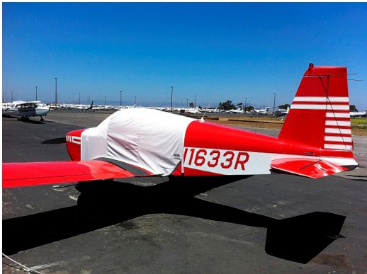
Grumman AA1 Extended Canopy Cover