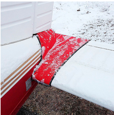
Piper PA-28 Tailcone Cover