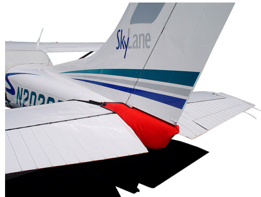
Cessna 182 Tailcone Cover