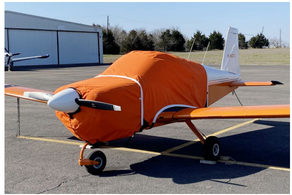
AA-1 Extended Canopy & Fully Enclosed Engine Cover