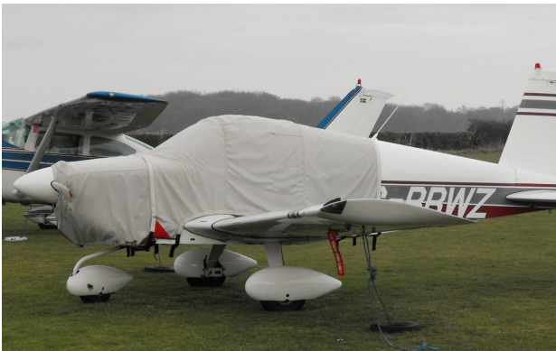
Grumman AA1 Extended Canopy Cover, Engine Cover

This cover type is made from Silver Acrylic Sunbrella canvas and is 100% lined with a soft and smooth microfiber. Bruce's Custom Covers developed this material combination especially for aircraft protection. The outer material is medium weight and treated for water resistance, UV resistance and anti-static buildup. The inner lining is a very soft and smooth microfiber to prevent scratching. The material is very reflective, and tests show that the cabin interior temperature can be reduced to near-ambient temperature on the hottest of days. It is water, ice and snow repellent, yet breathable to allow moisture to escape from between the cover and the aircraft surface.