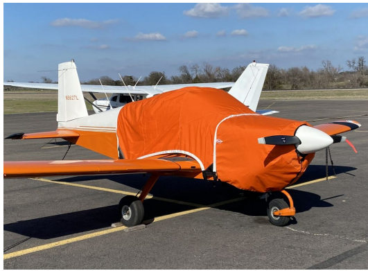
AA-1 Extended Canopy & Fully Enclosed Engine Cover

This cover type is made from Silver Acrylic Sunbrella canvas and is 100% lined with a soft and smooth microfiber. Bruce's Custom Covers developed this material combination especially for aircraft protection. The outer material is medium weight and treated for water resistance, UV resistance and anti-static buildup. The inner lining is a very soft and smooth microfiber to prevent scratching. The material is very reflective, and tests show that the cabin interior temperature can be reduced to near-ambient temperature on the hottest of days. It is water, ice and snow repellent, yet breathable to allow moisture to escape from between the cover and the aircraft surface.