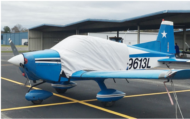
Grumman AA-1B Extended Canopy Cover

This cover type is made from Silver Acrylic Sunbrella canvas and is 100% lined with a soft and smooth microfiber. Bruce's Custom Covers developed this material combination especially for aircraft protection. The outer material is medium weight and treated for water resistance, UV resistance and anti-static buildup. The inner lining is a very soft and smooth microfiber to prevent scratching. The material is very reflective, and tests show that the cabin interior temperature can be reduced to near-ambient temperature on the hottest of days. It is water, ice and snow repellent, yet breathable to allow moisture to escape from between the cover and the aircraft surface.