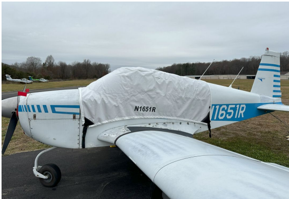
Grumman AA-1B Canopy Cover

This cover type is made from Silver Acrylic Sunbrella canvas and is 100% lined with a soft and smooth microfiber. Bruce's Custom Covers developed this material combination especially for aircraft protection. The outer material is medium weight and treated for water resistance, UV resistance and anti-static buildup. The inner lining is a very soft and smooth microfiber to prevent scratching. The material is very reflective, and tests show that the cabin interior temperature can be reduced to near-ambient temperature on the hottest of days. It is water, ice and snow repellent, yet breathable to allow moisture to escape from between the cover and the aircraft surface.