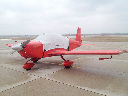
AA1 Canopy Cover, Engine Plugs