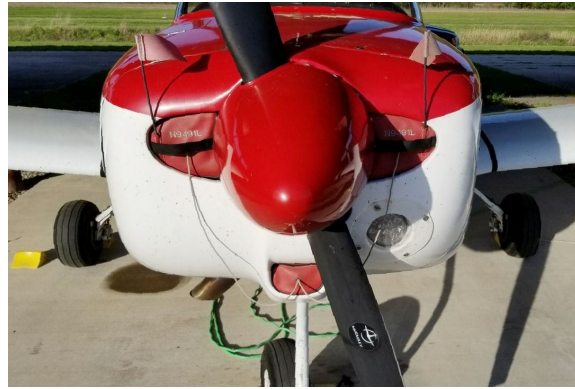
Grumman AA-1 Engine Inlet Plugs