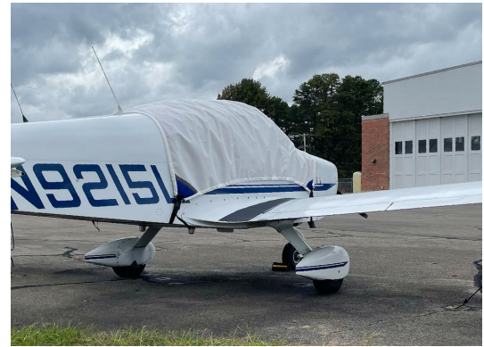
Grumman AA-1 Canopy Cover