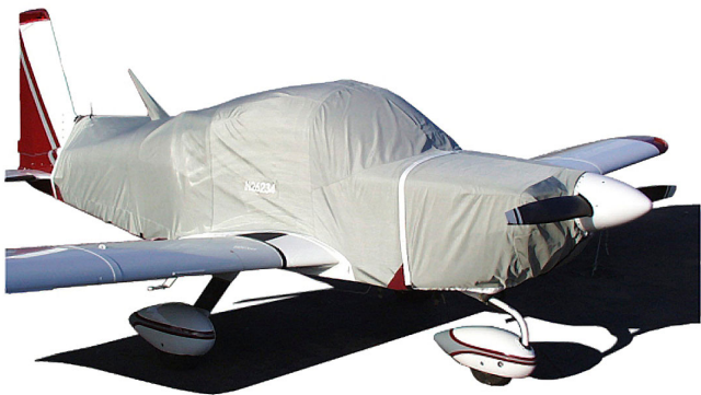
Grumman AA-5 Extended Canopy Cover & Engine Cover