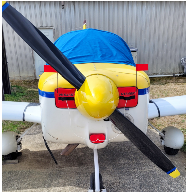
Grumman AA-1B Engine Plugs

and dried if necessary. Engine plugs have warning flags that are visible from the cockpit or 'remove before flight' streamers sewn onto the face of the plugs. Most plugs are imprinted with the aircraft registration number in black for an extra charge. Storage bag NOT included. Engine plugs may be inserted after flight when the engine is still warm. Engine Inlet Plugs are commonly referred to as Cowl Plugs, Intake Plugs, Cowl Blocks, Engine Blocks, and Engine Bungs.