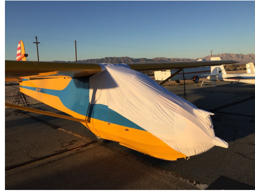
Schweizer SGU 2-22EK Canopy/Nose Cover, test fit cover