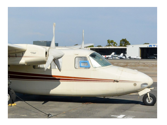
Aero Commander AC500 Ptopellor/Spinner Covers