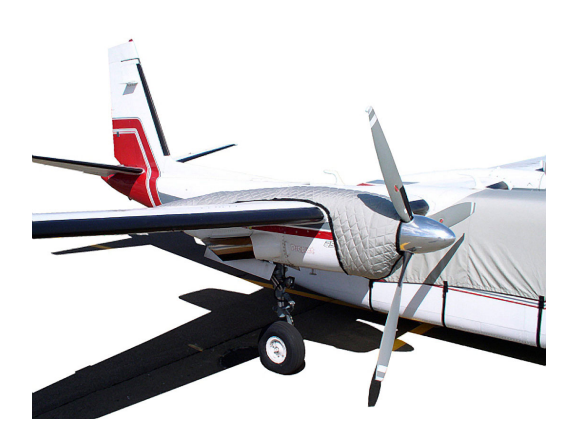
Aero Commander Insulated Engine Cover