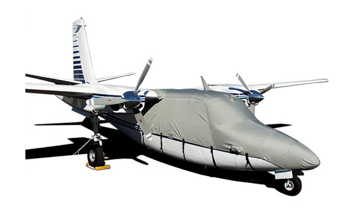
Aero Commander 500S Canopy/Nose Cover