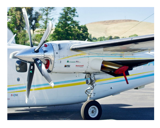
Aero Commander 690B Engine Inlet & Exhaust Plugs