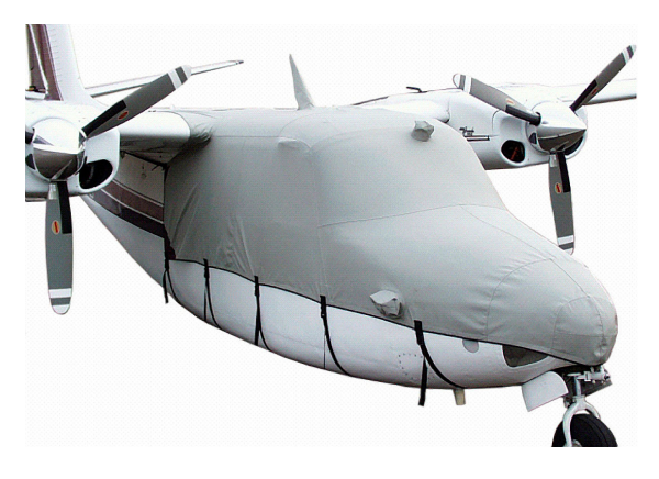
Canopy/Nose Cover (extends over top past leading edge)