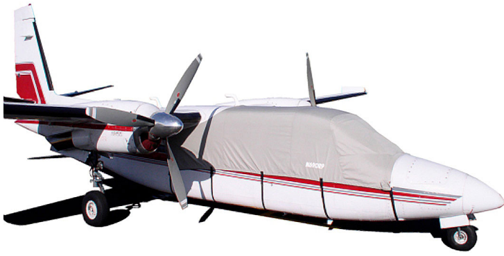
Aero Commander 690b Canopy Cover