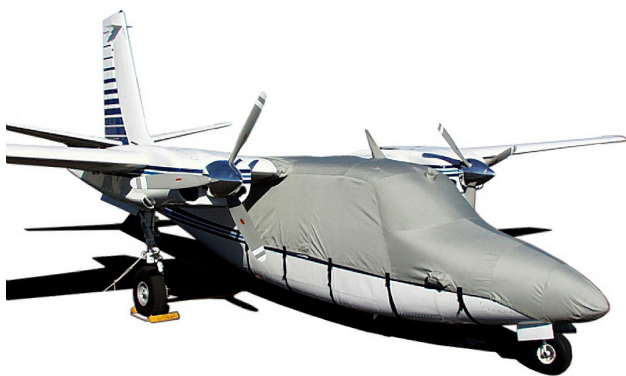
Aero Commander 500S Canopy/Nose Cover