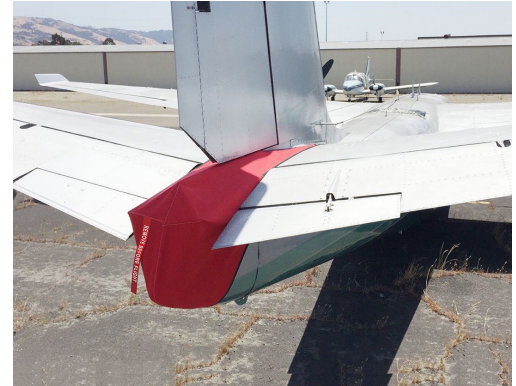
Rockwell Aero Commander Tailcone Cover