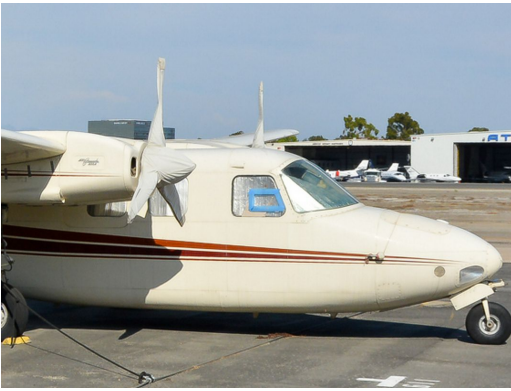
Aero Commander AC500 Ptopellor/Spinner Covers