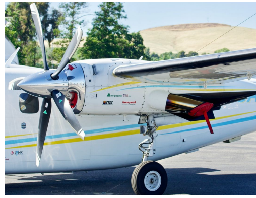
Aero Commander 690B Engine Inlet & Exhaust Plugs