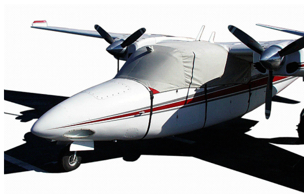
Aero Commander 680 Canopy Cover