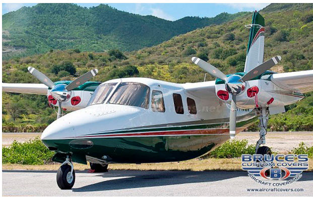
Aero Commander 500 Engine Inlet Plugs