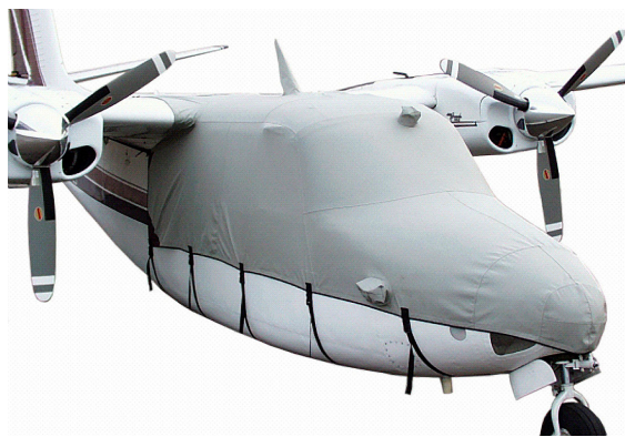
Canopy/Nose Cover (extends over top past leading edge)