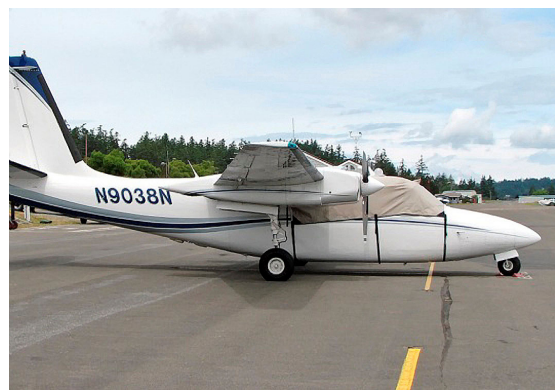
Aero Commander 500 Canopy Cover