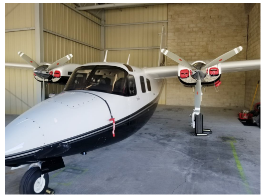
Aero Commander 500-A Pitot Covers