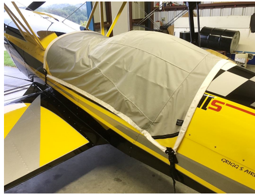
Acro Sport Acro II, Acroduster Travel Cover, Light Weight Travel Canopy Cover