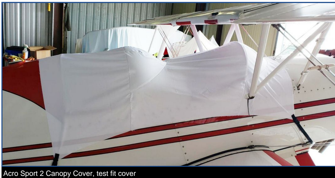
Acro Sport 2 Canopy Cover, test fit cover