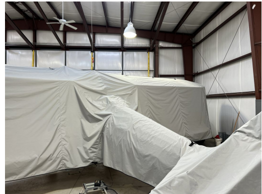
Stearman PT-13 Hangar Dust Cover, 3D model