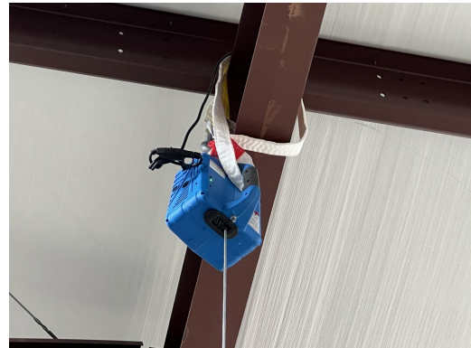
Stearman PT-13 Full Body Dust Cover, Remote Control Winch