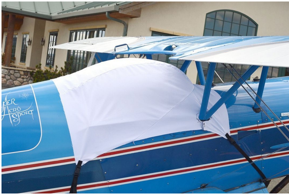
Acro Sport Canopy Cover