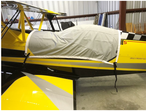
Acro Sport Acro II, Acroduster Travel Cover, Light Weight Travel Canopy Cover