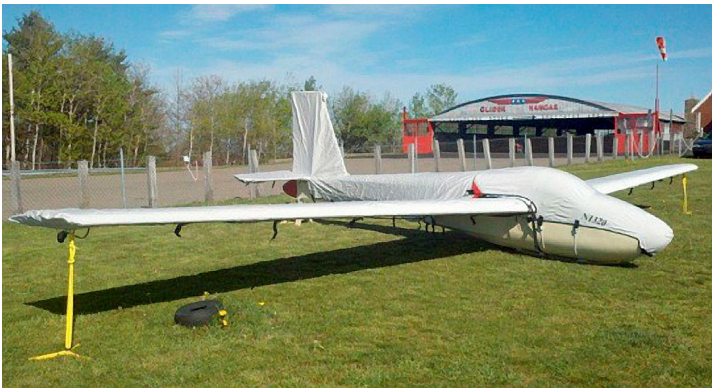
Schweizer 1-26B Canopy/Nose, Empennage & Wing Covers