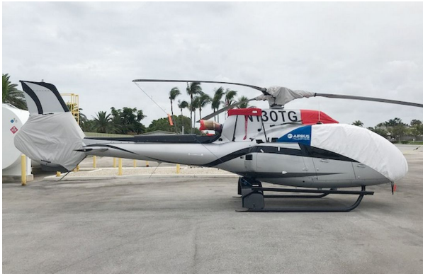
AIRBUS H130 T2, Intake, Exhaust & Tailfan Covers

length zippers and optional deice “boots” designed to accept a preheater hose; a small opening at the tip of the cover allows for some air circulation and drainage in freezing weather. Some part numbers have features for an extra charge.