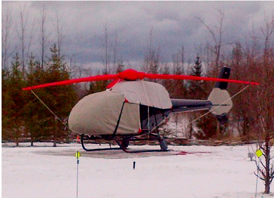
EC-130 Bubble, Engine, Rotor Hub, Blade & Tailfan Covers

This cover type is made from Silver Acrylic Sunbrella canvas and is 100% lined with a soft and smooth microfiber. Bruce's Custom Covers developed this material combination especially for aircraft protection. The outer material is medium weight and treated for water resistance, UV resistance and anti-static buildup. The inner lining is a very soft and smooth microfiber to prevent scratching. The material is very reflective, and tests show that the cabin interior temperature can be reduced to near-ambient temperature on the hottest of days. It is water, ice and snow repellent, yet breathable to allow moisture to escape from between the cover and the aircraft surface.