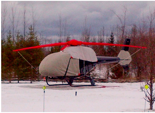
EC-130 Bubble, Engine, Rotor Hub, Blade & Tailfan Covers