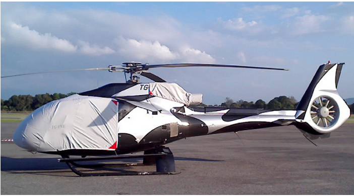
Bubble Cover and Intake/Exhaust Cover

some air circulation and drainage in freezing weather. Some part numbers have features for an extra charge.