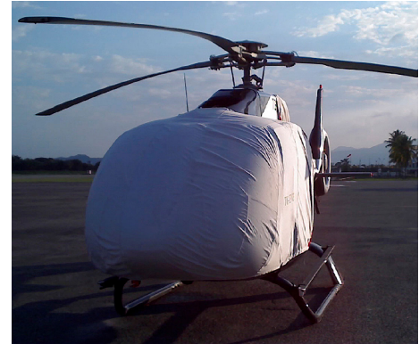
Bubble Cover and Intake/Exhaust Cover