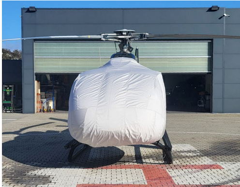
Airbus Helicopter H-130 Bubble Cover, Extends To Cover Fwd Engine Inlet

This cover type is made from Silver Acrylic Sunbrella canvas and is 100% lined with a soft and smooth microfiber. Bruce's Custom Covers developed this material combination especially for aircraft protection. The outer material is medium weight and treated for water resistance, UV resistance and anti-static buildup. The inner lining is a very soft and smooth microfiber to prevent scratching. The material is very reflective, and tests show that the cabin interior temperature can be reduced to near-ambient temperature on the hottest of days. It is water, ice and snow repellent, yet breathable to allow moisture to escape from between the cover and the aircraft surface.