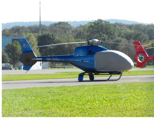
EC-130 Bubble, Tailfan, and Rotor Hub Cover