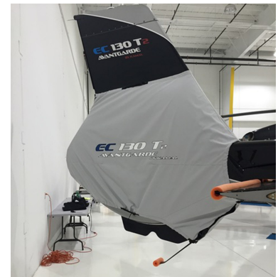
EC-130 Tailfan Cover