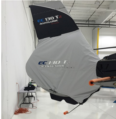
EC-130 Tailfan Cover

The Tailboom Cover details vary by model, but generally the helicopter tail boom cover encloses the tail boom from the "bottleneck" to the aft end. They usually also cover the horizontal stabilizers, and are custom made to allow for antennae, lights, and other protrusions. They attach with straps underneath the tail boom. Covers for the vertical and horizontal stabilizers are also available separately. Specific information for each model is available on request.