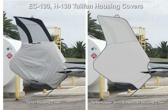
Airbus Helicopter H-130 Tailfan Housing Covers