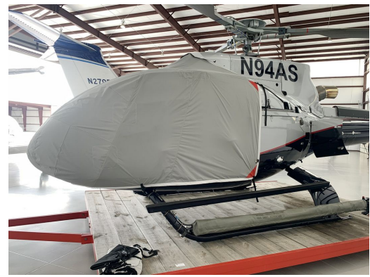
Airbus H-130 Bubble Cover, Travel Weight