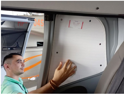
Airbus Helicopter EC130 B4 Side Window Heatshields