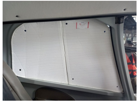
Airbus Helicopter EC130 B4 Side Window Heatshields