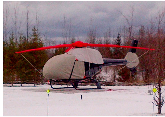
EC-130 Bubble, Engine, Rotor Hub, Blade & Tailfan Covers