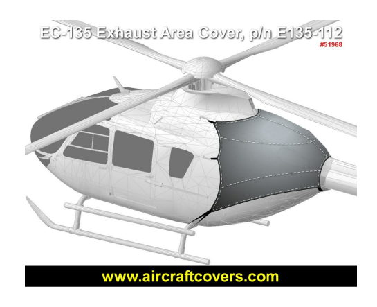
EC135 Exhaust Area Cover, illustration