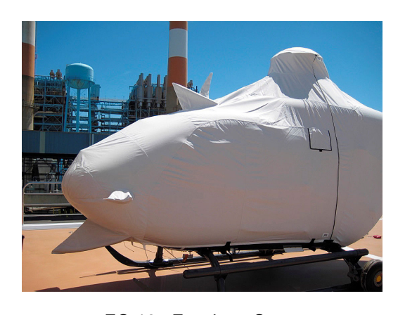
EC-135 Fuselage Cover