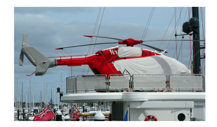
Eurocopter EC-135 Bubble, Engine, Rotor Hub, Tail Surfaces Covers