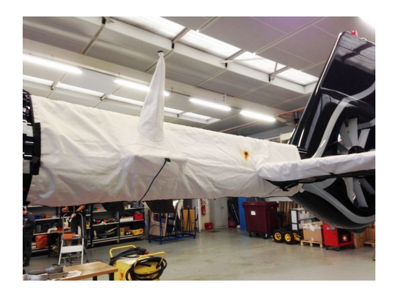
Airbus EC-135 Tailboom/Stabilizer Cover

The Tailboom Cover details vary by model, but generally the helicopter tail boom cover encloses the tail boom from the "bottleneck" to the aft end. They usually also cover the horizontal stabilizers, and are custom made to allow for antennae, lights, and other protrusions. They attach with straps underneath the tail boom. Covers for the vertical and horizontal stabilizers are also available separately. Specific information for each model is available on request.