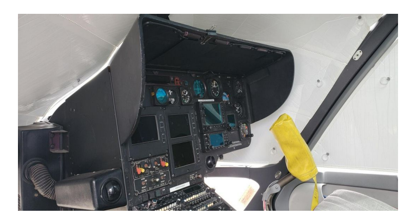
Airbus Helicopter H-135 Cockpit HeatShields