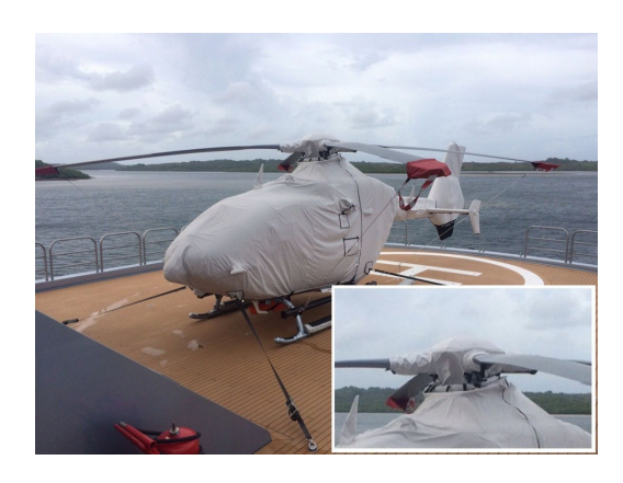
Airbus Helicopter AH135 Main Rotor Hub Cover

The Airbus Helicopter EC-135 Intake Cover. Details vary by model, but generally helicopter intake covers are designed to enclose the intake are only. They are smaller than helicopter engine covers, and their attachment details can vary from straps, to snaps, or some combination of the two. Specific information for each model is available on request.