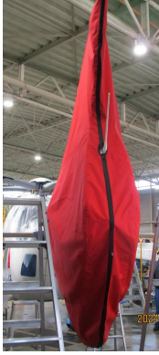
Airbus EC145 Tailfan Housing Fenestron Cover

The Tailboom Cover details vary by model, but generally the helicopter tail boom cover encloses the tail boom from the "bottleneck" to the aft end. They usually also cover the horizontal stabilizers, and are custom made to allow for antennae, lights, and other protrusions. They attach with straps underneath the tail boom. Covers for the vertical and horizontal stabilizers are also available separately. Specific information for each model is available on request.