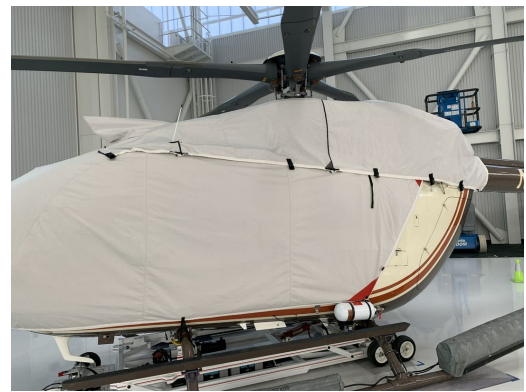
Eurocopter 145 Engine Area Cover, Bubble Cover