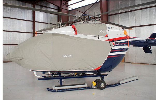
EC-135 Windshield/Skylights Cover, pinches in door jambs Bubble Cover w/ nose mounted radome, Upper Deck Plugs/Cover