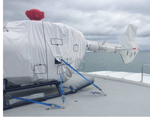
Eurocopter EC-145 D2 Main Body Cover, Tailboom/Fenestron Cover