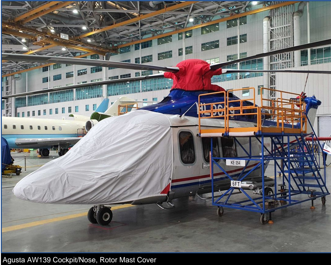
Agusta AW139 Cockpit/Nose, Rotor Mast Cover