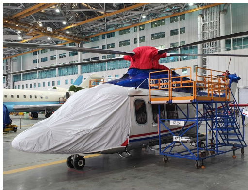
Agusta AW139 Cockpit/Nose, Rotor Mast Cover