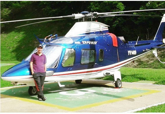
Agusta Power Cockpit & Cabin HeatShields