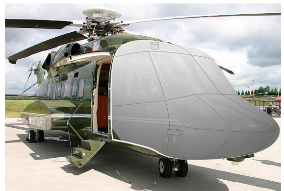
Sikorsky S-92 Windshield/Nose Cover (illustration)