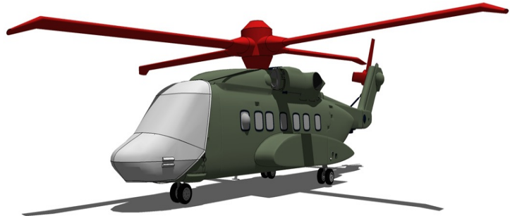
Sikorsky S-92 Windshield/Nose, Blade, Rotor Hub & Tail Rotor Covers