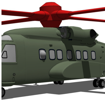
Sikorsky S-92 Main Rotor Hub Cover

WINTER USE MATERIAL - Made with Solution-Dyed Polyester fabric, this option is intended for seasonal use to aid in deicing, rain mitigation, or for occasional travel. The material is lighter and more compact, but more susceptible to UV damage and may have a shorter useful life if used continuously outside than the all-year use material.