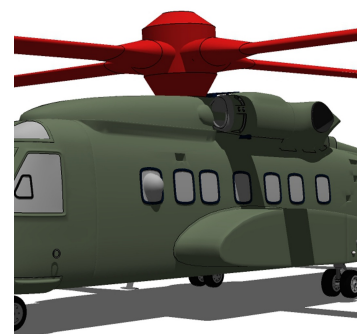
Sikorsky S-92 Main Rotor Hub Cover