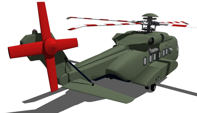
Sikorsky S-92 Tail Rotor Blade and Hub Covers