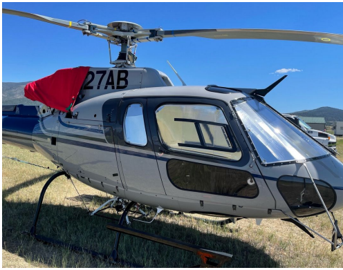
Eurocopter AS350-B3 Cabin HeatShields, Intake/Exhaust Cover