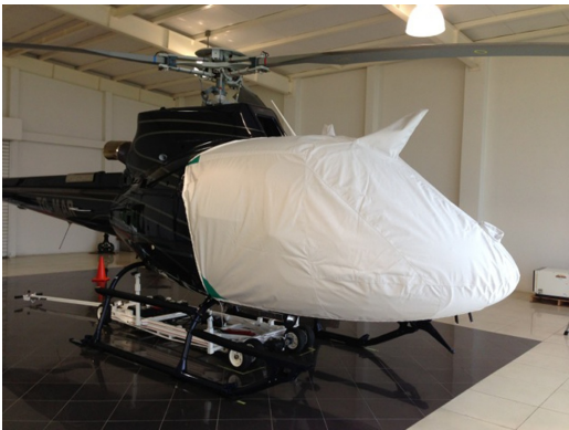
AS350 Bubble Cover