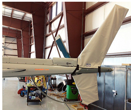
AS350 B3 Vertical Stabilizer Covers (set of 2)