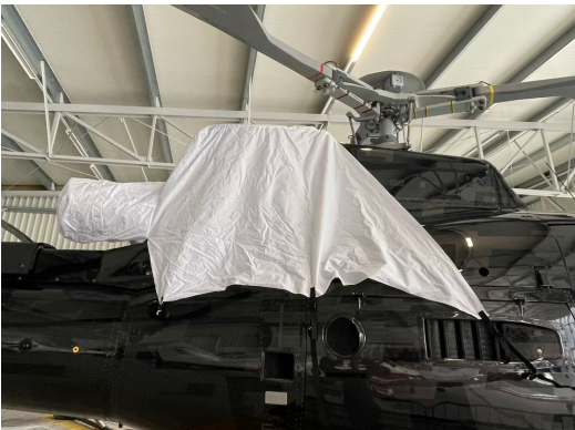
AS350 Intake/Exhaust Cover, test fit cover