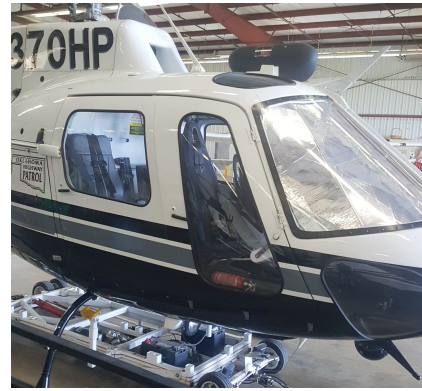
Aerospatiale AS350 Astar, Ecureuil, Esquilo, Fennec Windshield Heatshields