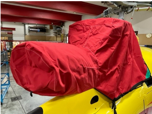
Airbus Helicopter H-125 & AS350 Intake/Exhaust Cover (newer design)

WINTER USE MATERIAL - Made with Solution-Dyed Polyester fabric, this option is intended for seasonal use to aid in deicing, rain mitigation, or for occasional travel. The material is lighter and more compact, but more susceptible to UV damage and may have a shorter useful life if used continuously outside than the all-year use material.