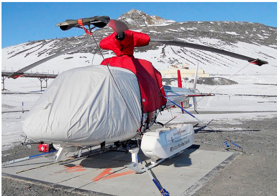
AS350 Bubble Cover w/ Cargo Mirror, Blade Tie-downs, Insulated Engine, Insulated Main Rotor Hub and Insulated Tail Rotor Covers

water resistance, UV resistance and anti-static buildup. The inner lining is a very soft and smooth microfiber to prevent scratching. The material is very reflective, and tests show that the cabin interior temperature can be reduced to near-ambient temperature on the hottest of days. It is water, ice and snow repellent, yet breathable to allow moisture to escape from between the cover and the aircraft surface.