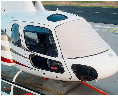
AS350 Windshield Cover, pinches in door jambs