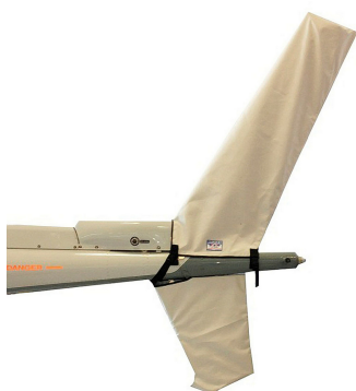
AS350B3 Vertical Stabilizers cover

The Tailboom Cover details vary by model, but generally the helicopter tail boom cover encloses the tail boom from the "bottleneck" to the aft end. They usually also cover the horizontal stabilizers, and are custom made to allow for antennae, lights, and other protrusions. They attach with straps underneath the tail boom. Covers for the vertical and horizontal stabilizers are also available separately. Specific information for each model is available on request.