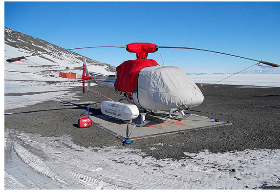
AS350 Bubble Cover w/ Cargo Mirror, Blade Tie-downs, Insulated Engine, Insulated Main Rotor Hub & Insulated Tail Rotor Covers