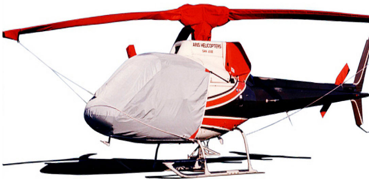
Bubble Cover, Intake/Exhaust, Rotor Mast, Tail Rotor & Main Body Covers

WINTER USE MATERIAL - Made with Solution-Dyed Polyester fabric, this option is intended for seasonal use to aid in deicing, rain mitigation, or for occasional travel. The material is lighter and more compact, but more susceptible to UV damage and may have a shorter useful life if used continuously outside than the all-year use material.