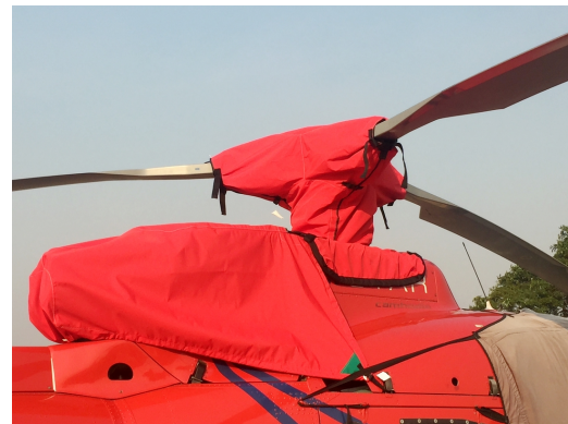
Airbus H-125 & Aerospatiale AS350 Intake/Exhaust Cover, Main Rotor Hub Cover with Weighted Skirt