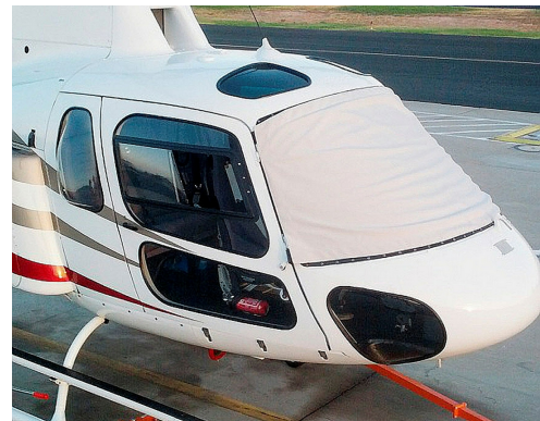
AS350 Windshield Cover, pinches in door jambs