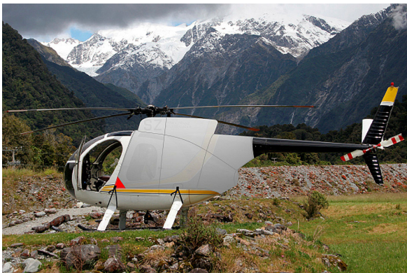
Engine Cover (illustration)