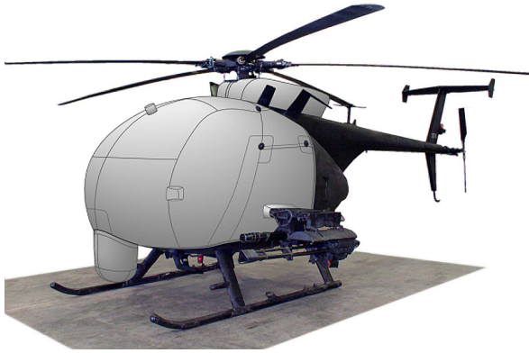
MH-6J Bubble, Flir & Doghouse Covers (illustration)

WINTER USE MATERIAL - Made with Solution-Dyed Polyester fabric, this option is intended for seasonal use to aid in deicing, rain mitigation, or for occasional travel. The material is lighter and more compact, but more susceptible to UV damage and may have a shorter useful life if used continuously outside than the all-year use material.