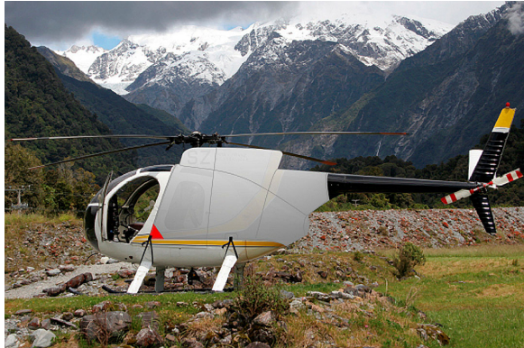
Engine Cover (illustration)

WINTER USE MATERIAL - Made with Solution-Dyed Polyester fabric, this option is intended for seasonal use to aid in deicing, rain mitigation, or for occasional travel. The material is lighter and more compact, but more susceptible to UV damage and may have a shorter useful life if used continuously outside than the all-year use material.