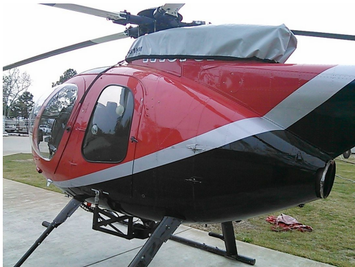
Customized Engine Cover

WINTER USE MATERIAL - Made with Solution-Dyed Polyester fabric, this option is intended for seasonal use to aid in deicing, rain mitigation, or for occasional travel. The material is lighter and more compact, but more susceptible to UV damage and may have a shorter useful life if used continuously outside than the all-year use material.