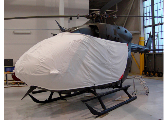
EC-145 Bubble Cover