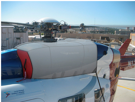
Upper Deck Plugs/Cover, extended to cover aft intake vents

The Engine Inlet Plugs are custom fit for your Airbus Helicopter UH-72A intakes, made with heavy-duty vinyl material, and stuffed with a single block of sculpted urethane foam. Each plug has a zipper that allows the foam to be removed and dried if necessary. Engine plugs have 'Remove Before Flight' streamers sewn onto the face of the plugs. Most plugs are imprinted with the aircraft registration number in black for an extra charge. Storage bag NOT included. Engine plugs may be inserted after flight when the engine is still warm. Engine Inlet Plugs are commonly referred to as Cowl Plugs, Intake Plugs, Cowl Blocks, Engine Blocks, and Engine Bunges.