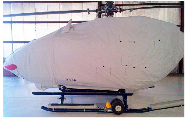
Eurocopter EC-145 Main Body Cover, also covers the bottom belly