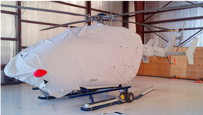
Main Body (also covers bottom), Tailboom, Vertical Pylon, Stabilizers and Tail Rotor Covers

Covers developed this material combination especially for aircraft protection. The outer material is medium weight and treated for water resistance, UV resistance and anti-static buildup. The inner lining is a very soft and smooth microfiber to prevent scratching. The material is very reflective, and tests show that the cabin interior temperature can be reduced to near-ambient temperature on the hottest of days. It is water, ice and snow repellent, yet breathable to allow moisture to escape from between the cover and the aircraft surface.