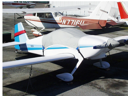
Vans's RV-6 Canopy Cover, Prop Cover