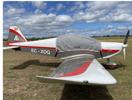
Direct Fly Alto Travel Cover, Light Weight Canopy Cover