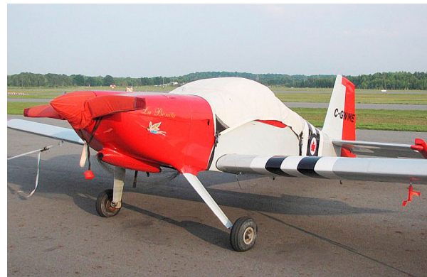
Van's RV-6 2-Blade Prop Cover