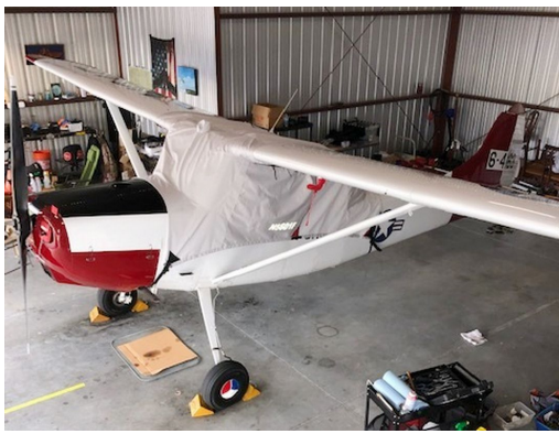
Cessna Bird Dog, L-19, O-1, 305 Canopy Cover, Over-Top Type