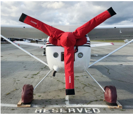
Cessna Skywagon Propellor/Spinner Cover, 3-blade type

the hottest of days. It is water, ice and snow repellent, yet breathable to allow moisture to escape from between the cover and the aircraft surface.