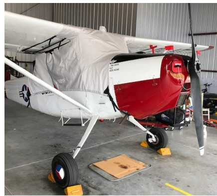
Cessna Bird Dog, L-19, O-1, 305 Canopy Cover, Over-Top Type