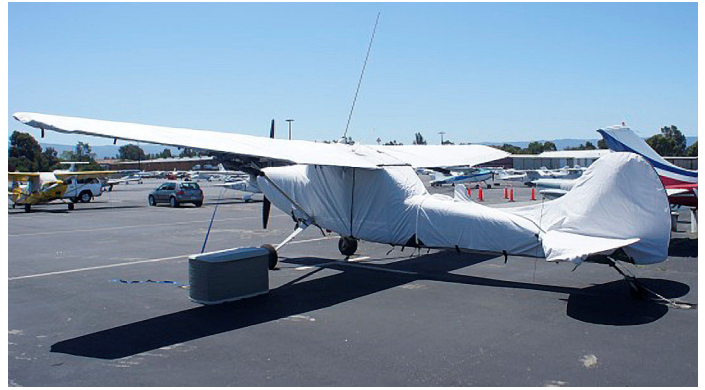
Cessna L-19 Extended Over-the-top Canopy, Engine, Empennage & Wing Covers