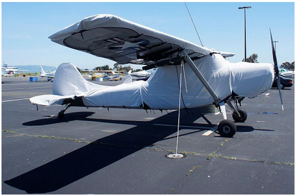
Wing Covers on Cessna Bird Dog