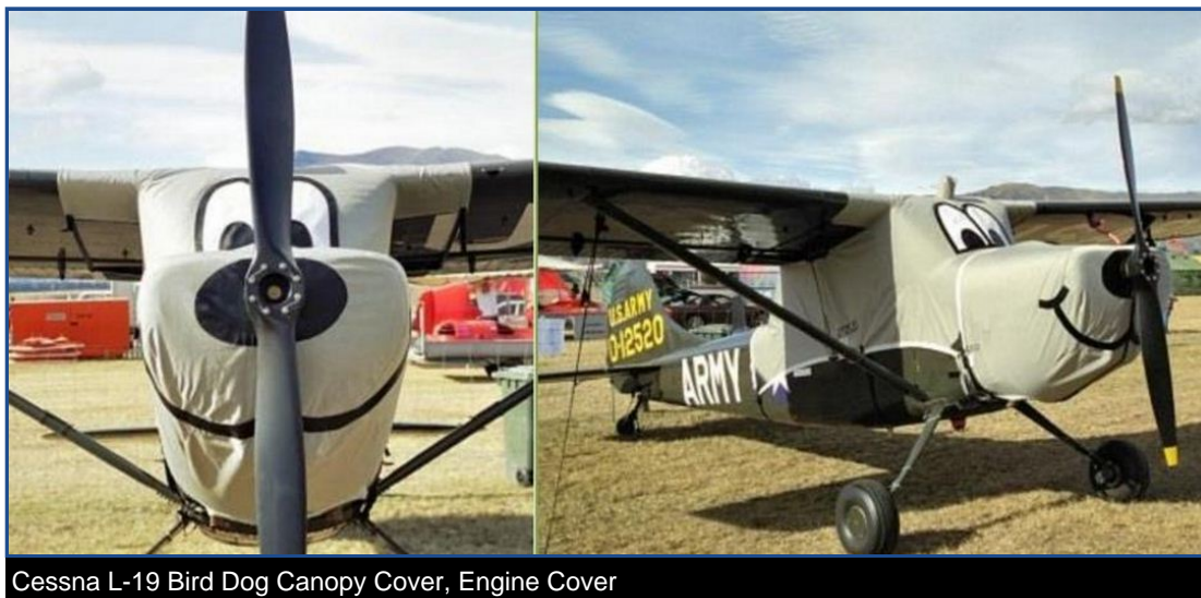
Cessna L-19 Bird Dog Canopy Cover, Engine Cover