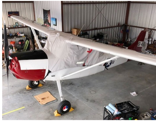
Cessna Bird Dog, L-19, O-1, 305 Canopy Cover, Over-Top Type