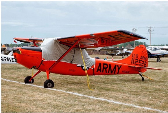
Cessna L-19 Bird Dog Canopy Cover

the hottest of days. It is water, ice and snow repellent, yet breathable to allow moisture to escape from between the cover and the aircraft surface.