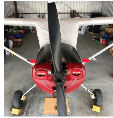
Cessna Bird Dog, L-19, O-1, 305 Engine Inlet Plugs