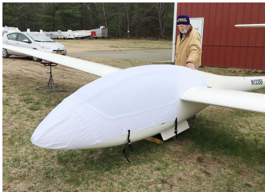
Grob 102 Astir CS Canopy/Nose Cover (test fit)