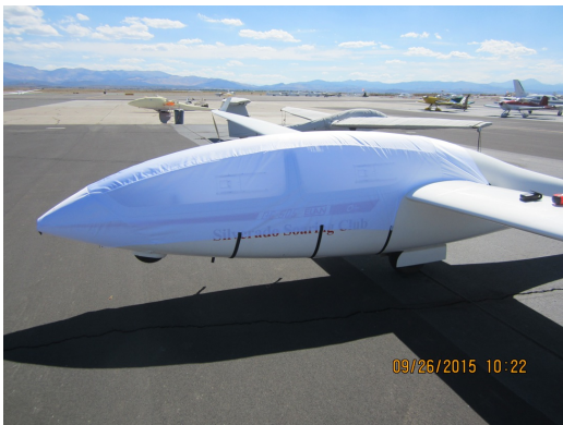
DG-505 Canopy/Nose Cover (test fit cover)