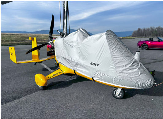
AR1 American Ranger Gyrocopter Travel Cover, Lightweight Canopy/Nose Cover

Travel Covers are made with Silver Solution-Dyed Polyester fabric and fully lined over the entire cover. The material is lightweight and more compact for easy storage in the aircraft. The polyester material is water resistant, but only intended for occasional use outside. We also have an ultra lightweight material available for fitted hangar dust covers. For daily outdoor use, the non-travel Sunbrella Cover is the best choice.