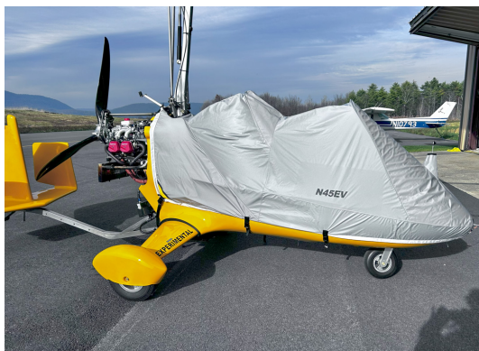
AR1 American Ranger Gyrocopter Travel Cover, Lightweight Canopy/Nose Cover

Travel Covers are made with Silver Solution-Dyed Polyester fabric and fully lined over the entire cover. The material is lightweight and more compact for easy storage in the aircraft. The polyester material is water resistant, but only intended for occasional use outside. We also have an ultra lightweight material available for fitted hangar dust covers. For daily outdoor use, the non-travel Sunbrella Cover is the best choice.