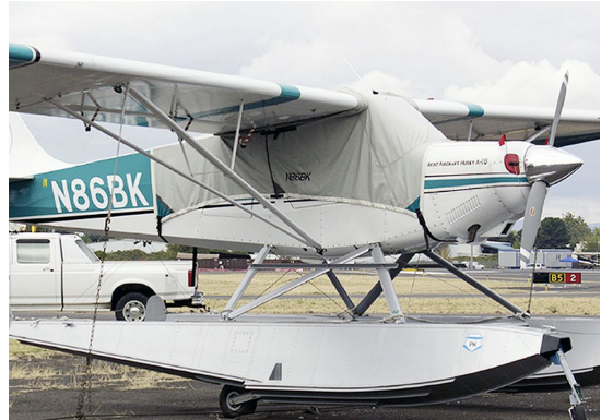
Aviat Husky Canopy Cover and Inlet Plugs