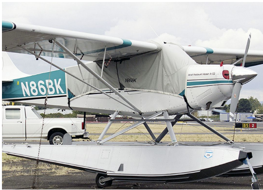
Aviat Husky Canopy Cover and Inlet Plugs

This cover type is made from Silver Acrylic Sunbrella canvas and is 100% lined with a soft and smooth microfiber. Bruce's Custom Covers developed this material combination especially for aircraft protection. The outer material is medium weight and treated for water resistance, UV resistance and anti-static buildup. The inner lining is a very soft and smooth microfiber to prevent scratching. The material is very reflective, and tests show that the cabin interior temperature can be reduced to near-ambient temperature on the hottest of days. It is water, ice and snow repellent, yet breathable to allow moisture to escape from between the cover and the aircraft surface.