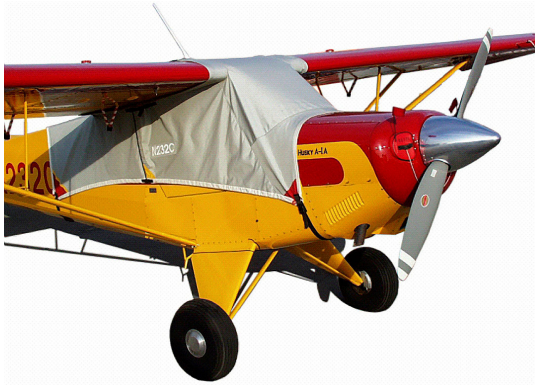
Aviat Husky Canopy Cover & Engine Plugs

Engine Inlet Plugs are custom fit for your Normand Dube Aerocruiser intakes, made with heavy-duty vinyl material, and stuffed with a single block of sculpted urethane foam. Each plug has a zipper that allows the foam to be removed and dried if necessary. Engine plugs have warning flags that are visible from the cockpit or 'remove before flight' streamers sewn onto the face of the plugs. Most plugs are imprinted with the aircraft registration number in black for an extra charge. Storage bag NOT included. Engine plugs may be inserted after flight when the engine is still warm. Engine Inlet Plugs are commonly referred to as Cowl Plugs, Intake Plugs, Cowl Blocks, Engine Blocks, and Engine Bung.