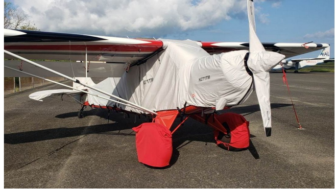
Piper L-21b Extended Canopy Cover, Tire Covers Aviat Husky Extended Canopy Cover, Engine, Prop, Empennage & Tire Covers