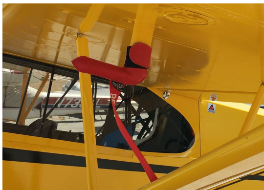
Cub Crafters CC-11 Carbon Cub Pitot Cover

Engine Inlet Plugs are custom fit for your Lewaero Ascender intakes, made with heavy-duty vinyl material, and stuffed with a single block of sculpted urethane foam. Each plug has a zipper that allows the foam to be removed and dried if necessary. Engine plugs have warning flags that are visible from the cockpit or 'remove before flight' streamers sewn onto the face of the plugs. Most plugs are imprinted with the aircraft registration number in black for an extra charge. Storage bag NOT included. Engine plugs may be inserted after flight when the engine is still warm. Engine Inlet Plugs are commonly referred to as Cowl Plugs, Intake Plugs, Cowl Blocks, Engine Blocks, and Engine Bungs.