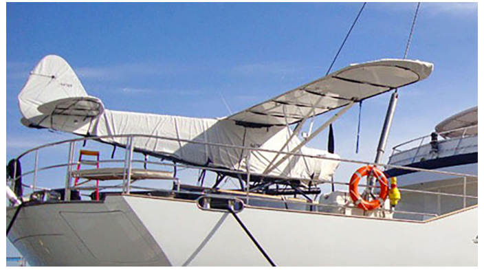
Piper PA-18 Super Cub Complete Cover set