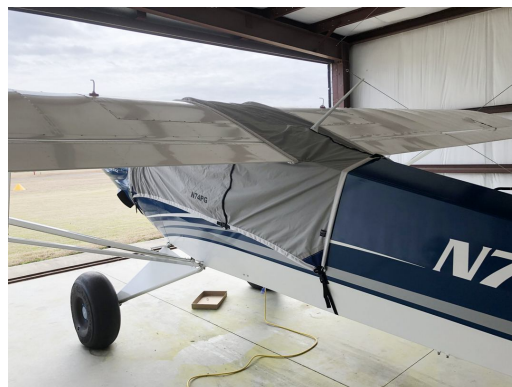
Cub Crafters Carbon Cub Travel Weight Canopy Cover