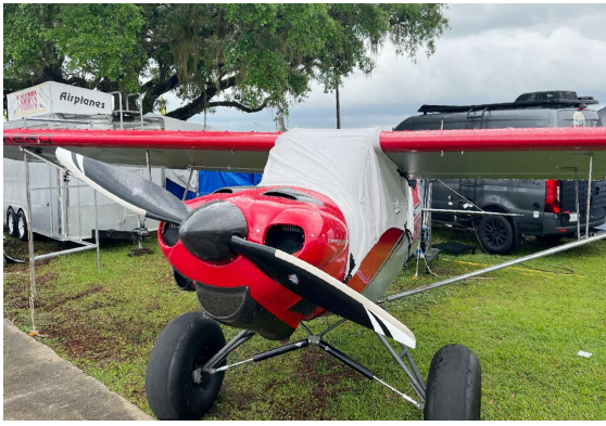
Cub Crafters CC-18 Canopy Cover