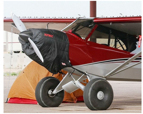
Cub Crafters Carbon Cub Insulated Engine Cover