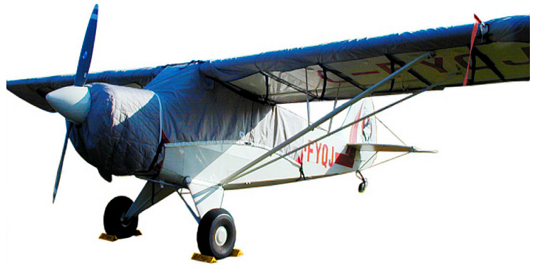
Aviat Husky Insulated Engine Cover, Canopy & Wing Covers