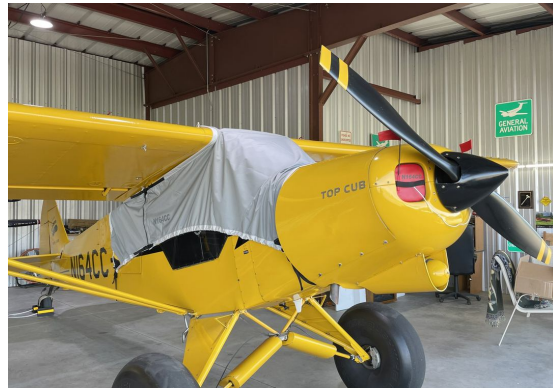
Cub Crafters CC-18 Light Weight Travel Canopy Cover, Engine Plugs