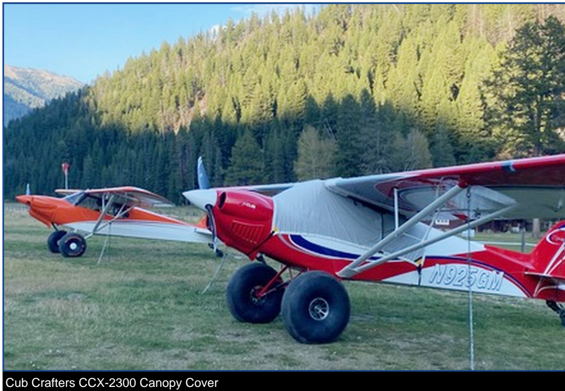
Cub Crafters CCX-2300 Canopy Cover