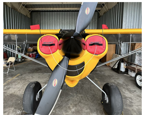
Cub Crafters CC-19 X-Cub Engine Plugs