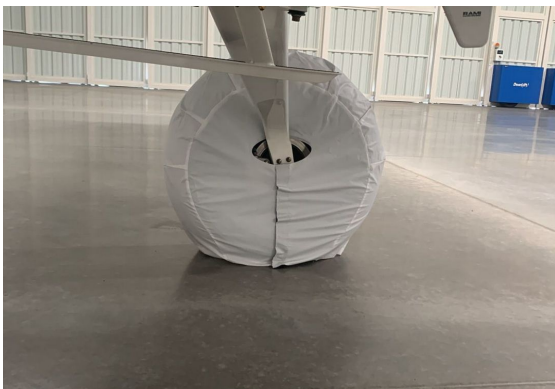
Cub Crafters Tire Covers, tricycle gear, test fit covers

ALL-YEAR USE MATERIAL - Made with Silver Acrylic Sunbrella canvas, the all-year use material is the best option for sun protection and cover longevity. This heavier more durable material is intended for all weather conditions, such as rain and snow or lots of sun.