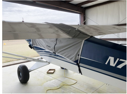
Cub Crafter Carbon Cub Travel Weight Canopy Cover