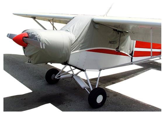
Piper PA-18 Super Cub Canopy & Engine Covers