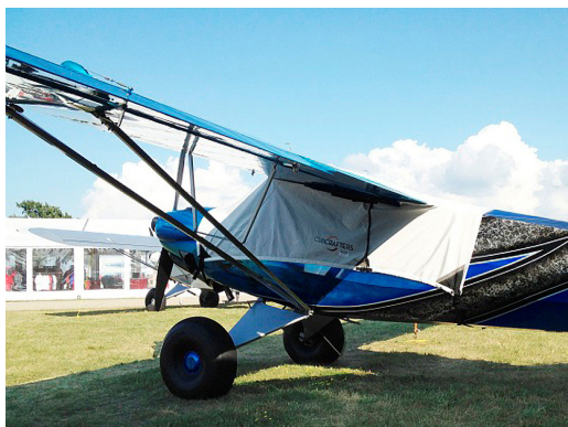
Cub Crafters Carbon Cub Canopy Cover

Travel Covers are made with Silver Solution-Dyed Polyester fabric and only lined over the windshield to save weight. The material is lightweight and more compact for easy stowage in the aircraft. The polyester material is water resistant, but only intended for occasional use outside. We also have an ultra lightweight material available for fitted hangar dust covers. For daily outdoor use, the non-travel Sunbrella Cover is the best choice.