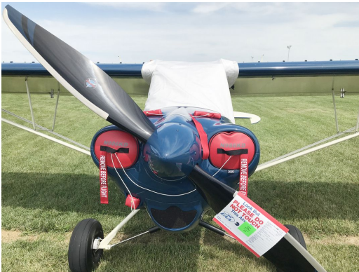
Cub Crafters EX2 Canopy Cover, Engine Plugs

Engine Inlet Plugs are custom fit for your Lewaero Ascender intakes, made with heavy-duty vinyl material, and stuffed with a single block of sculpted urethane foam. Each plug has a zipper that allows the foam to be removed and dried if necessary. Engine plugs have warning flags that are visible from the cockpit or 'remove before flight' streamers sewn onto the face of the plugs. Most plugs are imprinted with the aircraft registration number in black for an extra charge. Storage bag NOT included. Engine plugs may be inserted after flight when the engine is still warm. Engine Inlet Plugs are commonly referred to as Cowl Plugs, Intake Plugs, Cowl Blocks, Engine Blocks, and Engine Bungs.