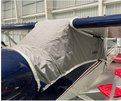
CubCrafter CCX-2300 Light Weight Travel Cover

Travel Covers are made with Silver Solution-Dyed Polyester fabric and only lined over the windshield to save weight. The material is lightweight and more compact for easy stowage in the aircraft. The polyester material is water resistant, but only intended for occasional use outside. We also have an ultra lightweight material available for fitted hangar dust covers. For daily outdoor use, the non-travel Sunbrella Cover is the best choice.