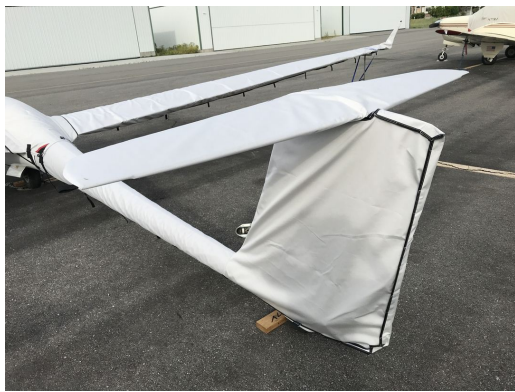
Schleicher ASW-27b Empennage & Wing Covers