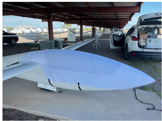
Schleicher ASW-19 Canopy/Nose Cover, test fit cover