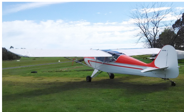
Auster J5 Autocar Wing Covers