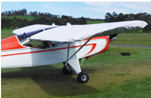
Auster J5 Autocar Wing Covers

WINTER USE MATERIAL - Made with Solution-Dyed Polyester fabric, this option is intended for seasonal use to aid in deicing, rain mitigation, or for occasional travel. The material is lighter and more compact, but more susceptible to UV damage and may have a shorter useful life if used continuously outside than the all-year use material.