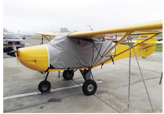
Avid Flyer Extended Canopy Cover