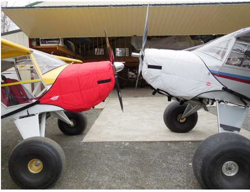
Avid Insulated Engine Covers