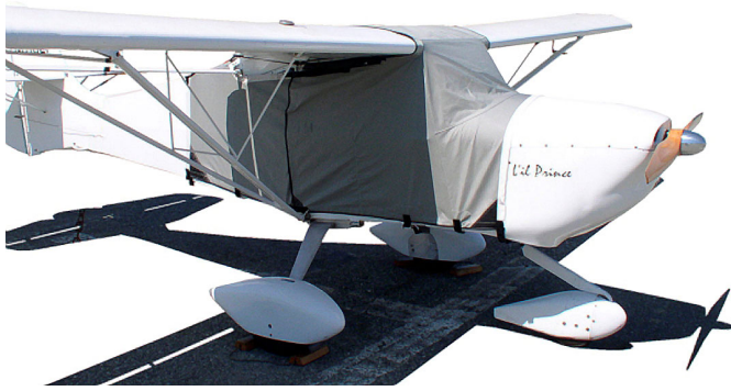
Avid Flyer Extended Canopy Cover