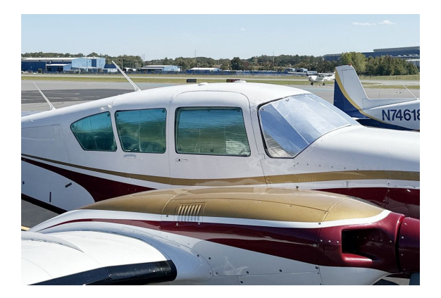
Piper Aztec HeatShields