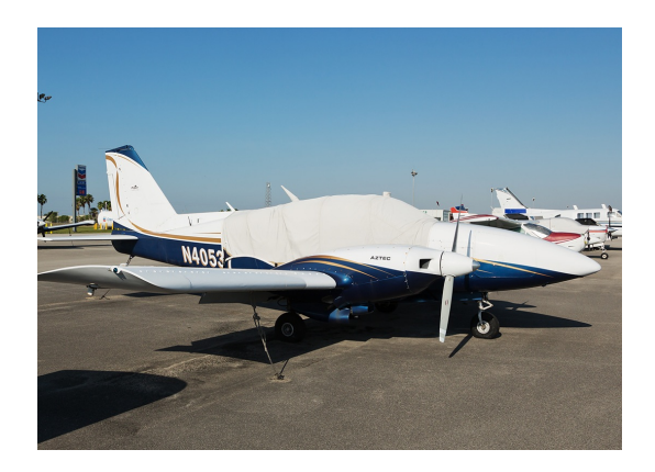
Piper Aztec Canopy Cover

Travel Covers are made with Silver Solution-Dyed Polyester fabric and only lined over the windshield to save weight. The material is lightweight and more compact for easy stowage in the aircraft. The polyester material is water resistant, but only intended for occasional use outside. We also have an ultra lightweight material available for fitted hangar dust covers. For daily outdoor use, the non-travel Sunbrella Cover is the best choice.