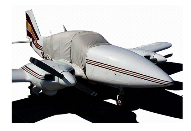
Aztec Canopy Cover