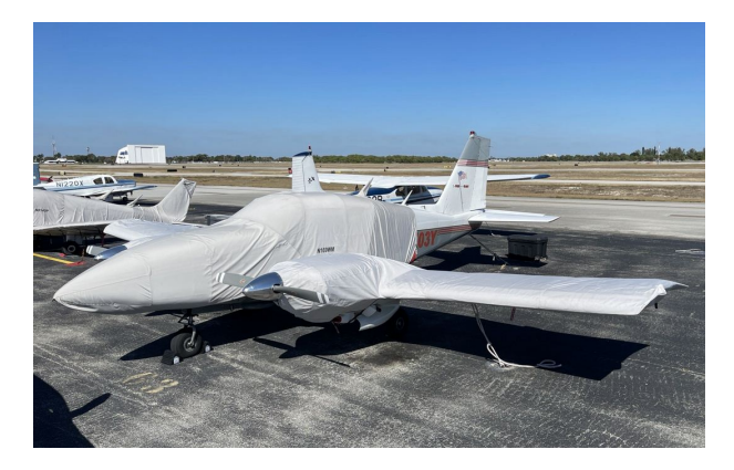
Piper Aztec Extended Canopy/Nose & Wing/Engine Covers

WINTER USE MATERIAL - Made with Solution-Dyed Polyester fabric, this option is intended for seasonal use to aid in deicing, rain mitigation, or for occasional travel. The material is lighter and more compact, but more susceptible to UV damage and may have a shorter useful life if used continuously outside than the all-year use material.