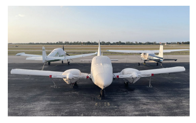
Piper Aztec Complete Cover Set