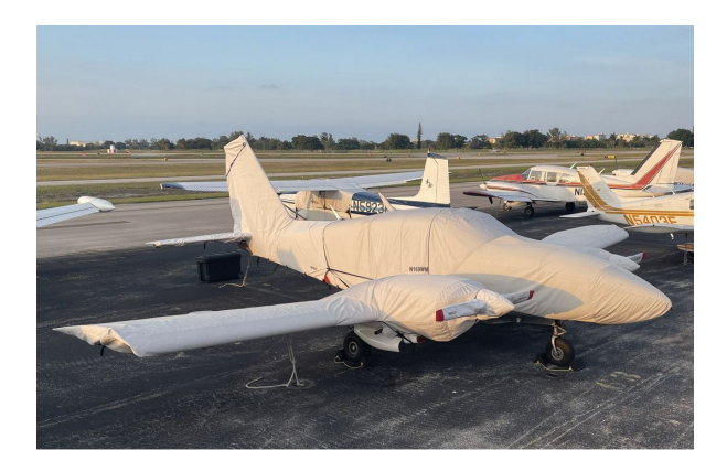
Piper Aztec Complete Cover Set