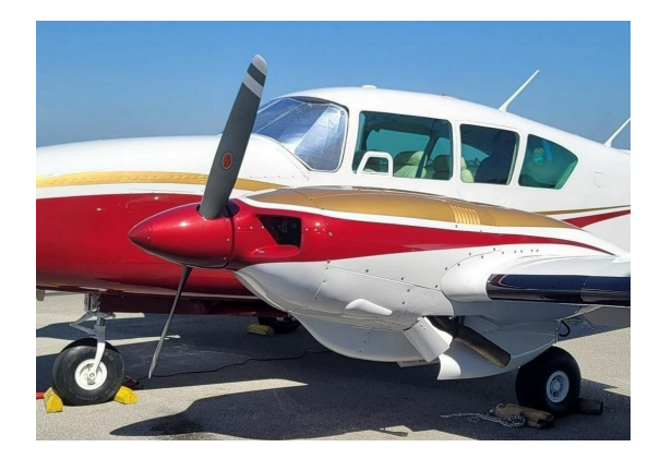
Piper Aztec Windshield HeatShield

Windshield Heatshields are interior sunshades for an aircraft's front windshield. The product is a unique composite of closed-cell foam with a silver mylar finish. The semi-rigid design is stiff enough to stand along the inside of the windshield using sun visors or window framing. It folds up flat and easily stores in the included storage sleeve. Some designs may require velcro and suction cups or split right and left sides. A Heatshield is an excellent short-term remedy for cockpit overheating. An external fabric cover is far more effective and practical for long-term protection.