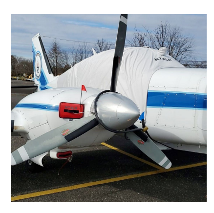
Piper Aztec Canopy Cover, Engine Plugs

are imprinted with the aircraft registration number in black for an extra charge. Storage bag NOT included. Engine plugs may be inserted after flight when the engine is still warm. Engine Inlet Plugs are commonly referred to as Cowl Plugs, Intake Plugs, Cowl Blocks, Engine Blocks, and Engine Bungs.