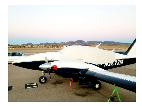
Piper Aztec Canopy Cover & Engine Plugs