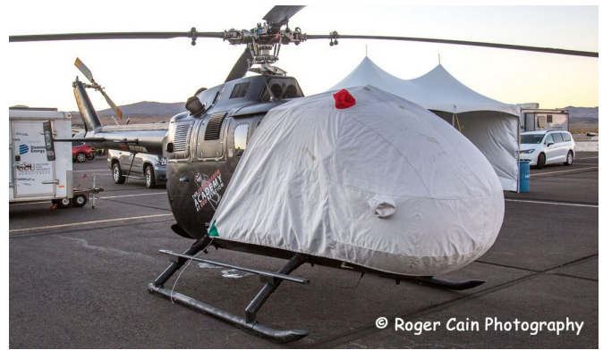
MBB BO-105 Bubble Cover