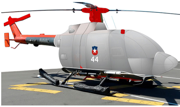
MBB BO-105 Full Body, Rotor Mast & Tail Rotor Covers (illustration)