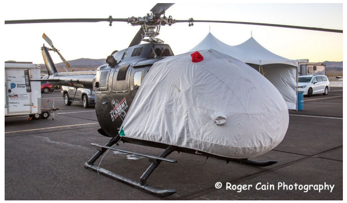
MBB BO-105 Bubble Cover