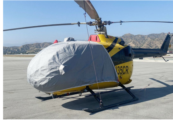
Eurocopter BO-105 Bubble Cover, Standard Model