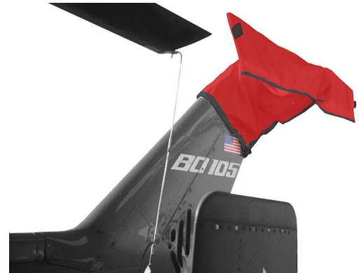
MBB BO-105 Tail Rotor/Gearbox Cover