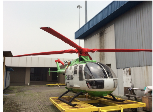
MBB BO-105 Blade, Rotor Head & Tail Rotor Covers