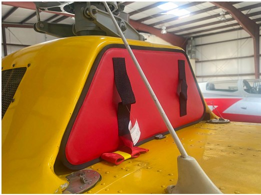
BO 105CB Intake Plug

The Engine Inlet Plugs are custom fit for your Eurocopter BO-105 intakes, made with heavy-duty vinyl material, and stuffed with a single block of sculpted urethane foam. Each plug has a zipper that allows the foam to be removed and dried if necessary. Engine plugs have 'Remove Before Flight' streamers sewn onto the face of the plugs. Most plugs are imprinted with the aircraft registration number in black for an extra charge. Storage bag NOT included. Engine plugs may be inserted after flight when the engine is still warm. Engine Inlet Plugs are commonly referred to as Cowl Plugs, Intake Plugs, Cowl Blocks, Engine Blocks, and Engine Bungs.