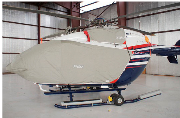
Bubble Cover w/ nose mounted radome, Upper Deck Plugs/Cover

This cover type is made from Silver Acrylic Sunbrella canvas and is 100% lined with a soft and smooth microfiber. Bruce's Custom Covers developed this material combination especially for aircraft protection. The outer material is medium weight and treated for water resistance, UV resistance and anti-static buildup. The inner lining is a very soft and smooth microfiber to prevent scratching. The material is very reflective, and tests show that the cabin interior temperature can be reduced to near-ambient temperature on the hottest of days. It is water, ice and snow repellent, yet breathable to allow moisture to escape from between the cover and the aircraft surface.