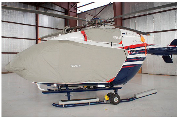
Bubble Cover w/ nose mounted radome, Upper Deck Plugs/Cover