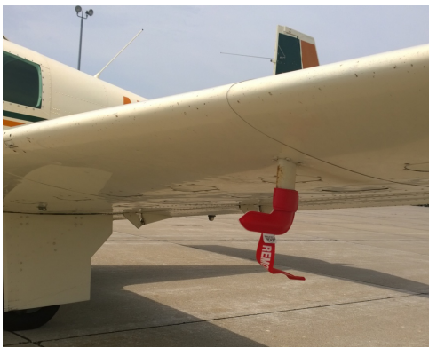
Mooney Pitot Cover