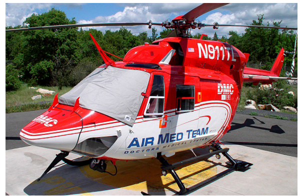
BK-117 Windshield Cover