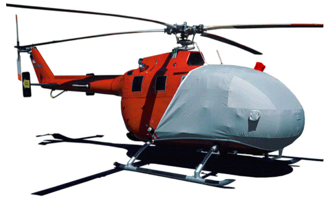
MBB BO-105 Bubble Cover