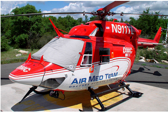
BK-117 Windshield Cover