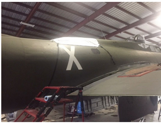
Hatch Cover on a classic B17.