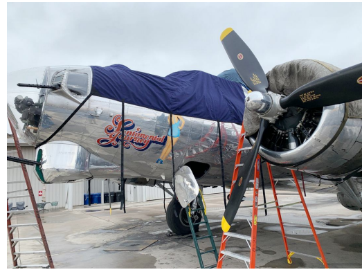
Boeing B-17 Canopy Cover