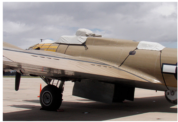
B-17 Canopy/Gun Turret Cover & Hatch Cover