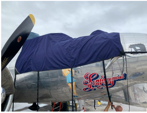
Boeing B-17 Canopy Cover