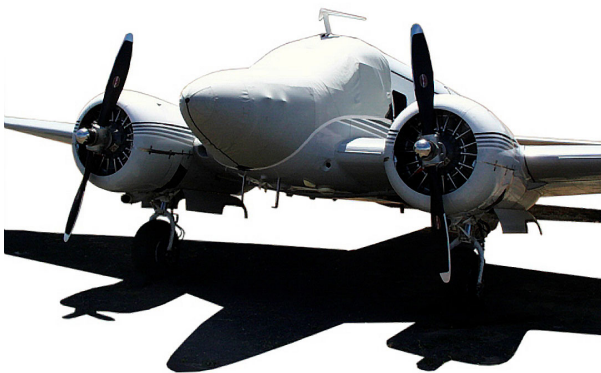
Beech 18 Cockpit/Nose Cover

This cover type is made from Silver Acrylic Sunbrella canvas and is 100% lined with a soft and smooth microfiber. Bruce's Custom Covers developed this material combination especially for aircraft protection. The outer material is medium weight and treated for water resistance, UV resistance and anti-static buildup. The inner lining is a very soft and smooth microfiber to prevent scratching. The material is very reflective, and tests show that the cabin interior temperature can be reduced to near-ambient temperature on the hottest of days. It is water, ice and snow repellent, yet breathable to allow moisture to escape from between the cover and the aircraft surface.