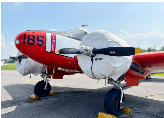
Beech 18 Engine Covers, non-insulated