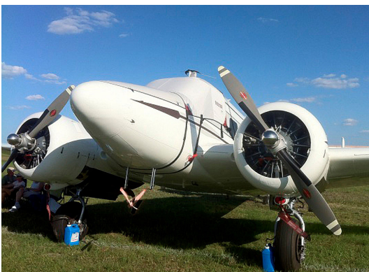
Beech 18 Cockpit Cover & Carb Inlet Plugs

This cover type is made from Silver Acrylic Sunbrella canvas and is 100% lined with a soft and smooth microfiber. Bruce's Custom Covers developed this material combination especially for aircraft protection. The outer material is medium weight and treated for water resistance, UV resistance and anti-static buildup. The inner lining is a very soft and smooth microfiber to prevent scratching. The material is very reflective, and tests show that the cabin interior temperature can be reduced to near-ambient temperature on the hottest of days. It is water, ice and snow repellent, yet breathable to allow moisture to escape from between the cover and the aircraft surface.