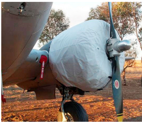
Beech D-18 Engine Covers, Center Section Oil Cooler Inlet Plugs, and Pitot Covers