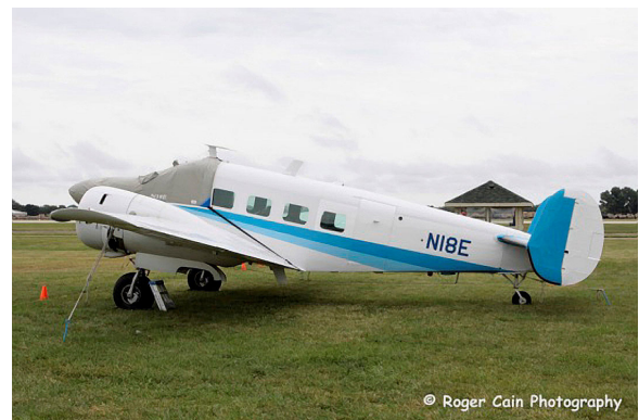
Twin Beech 18 Cockpit/Nose Cover