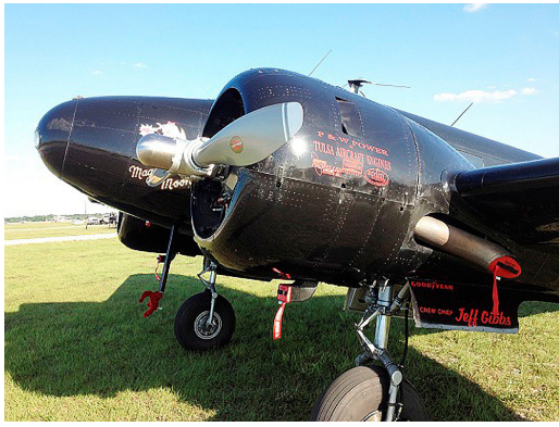
Beech 18 Exhaust & Carb Inlet plugs & Pitot Covers