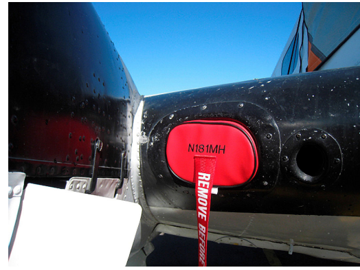
Beech 18 Oil Cooler Center Section Inlet Plugs