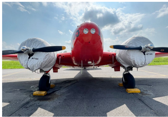
Beech 18 Engine Covers, non-insulated