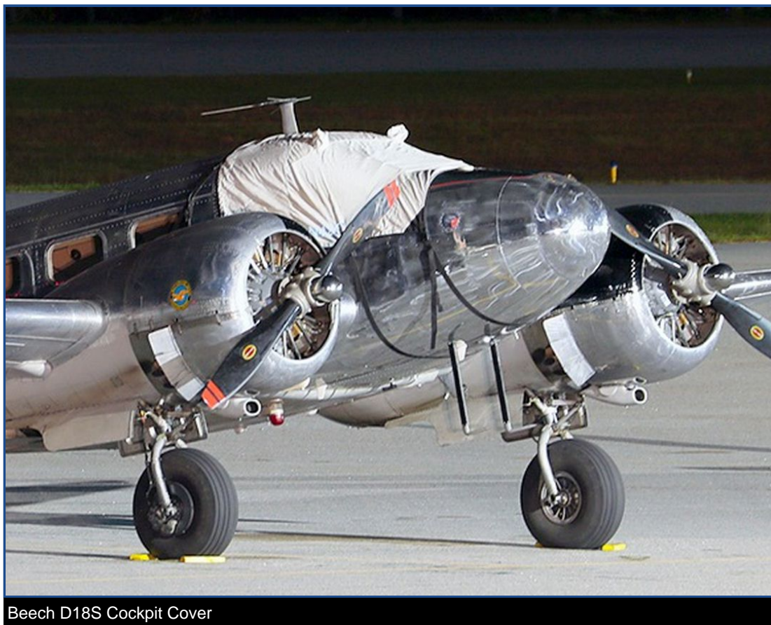
Beech D18S Cockpit Cover