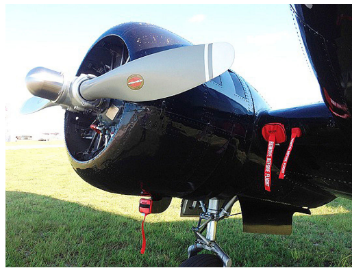
Beech 18 Carb Inlet, Oil Cooler Inlet & Air Inlet Plugs