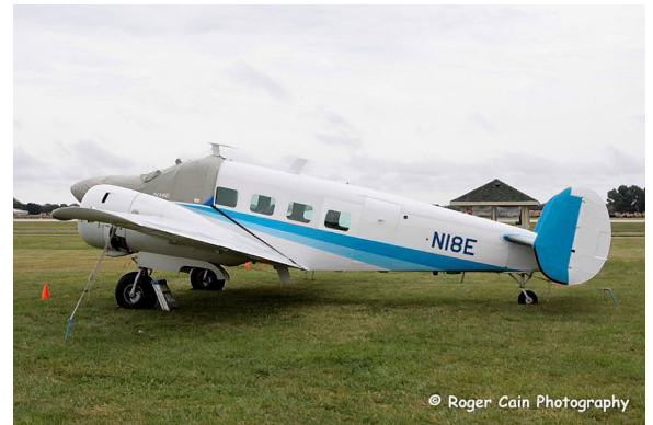
Twin Beech 18 Cockpit/Nose Cover