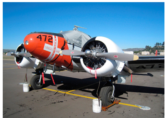
Beech 18 Cockpit Cover and Carb Air Inlet Plugs