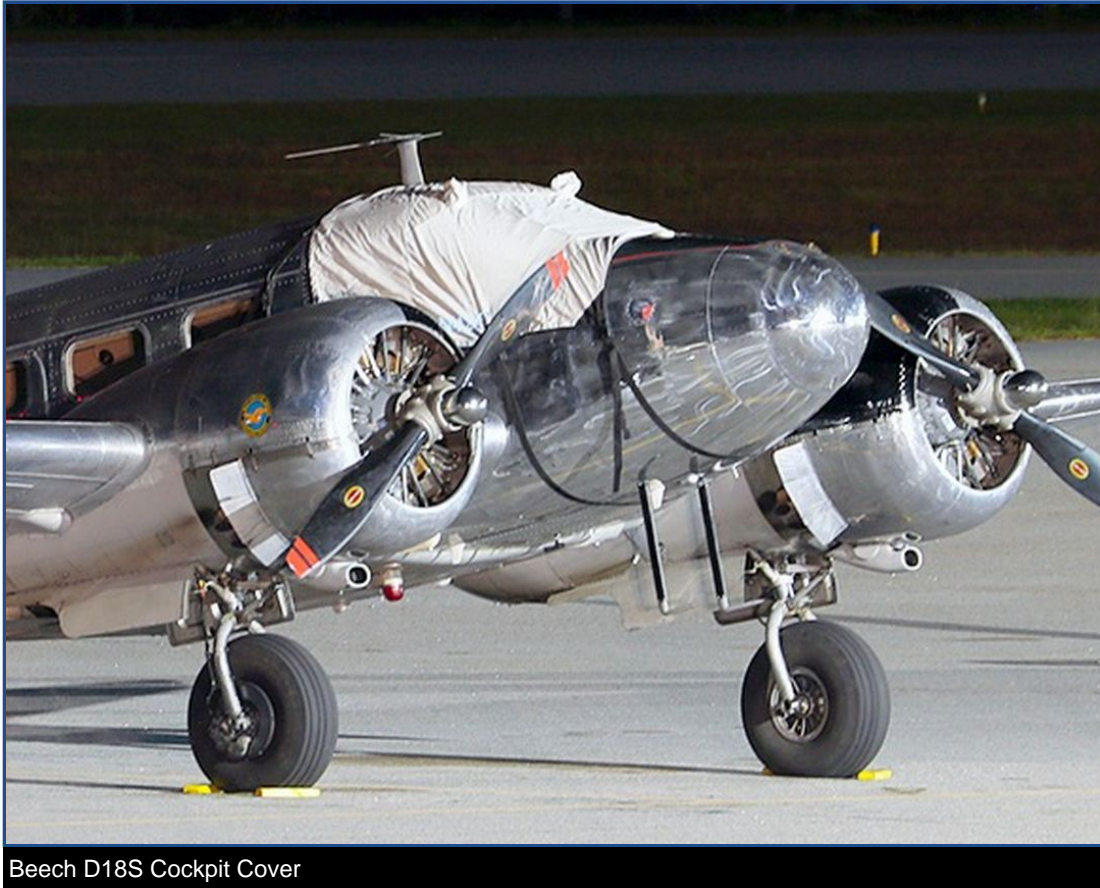
Beech D18S Cockpit Cover