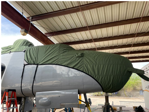
Mitchell B25 Cockpit/Nose Cover, & Turret Cover