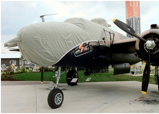
B26 Cockpit/Nose and Gun Turret Covers