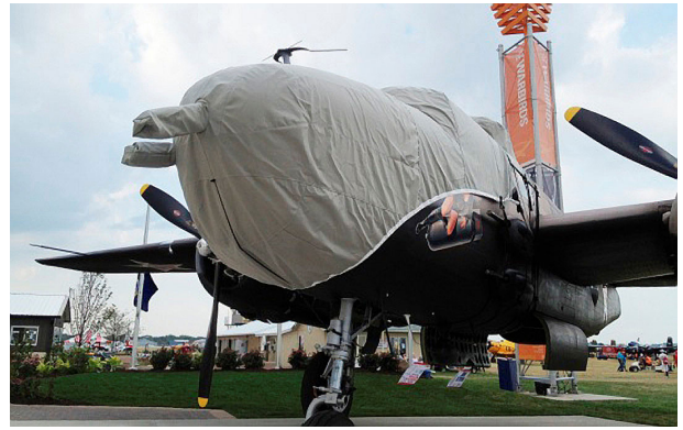
B26 Cockpit/Nose and Gun Turret Covers