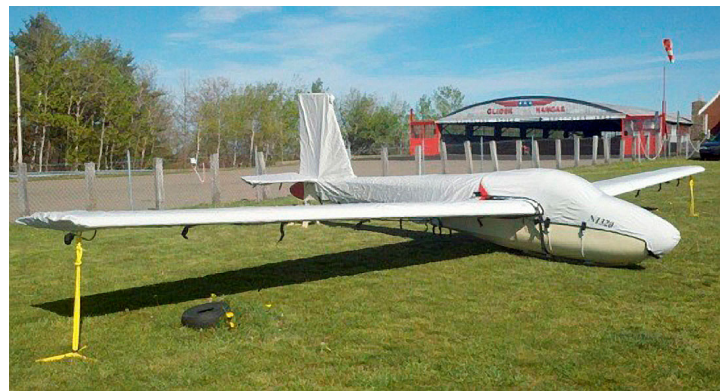
Schweizer 1-26B Canopy/Nose, Empennage & Wing Covers