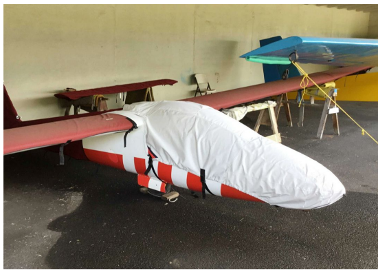
Pilatus B4 Canopy/Nose Cover