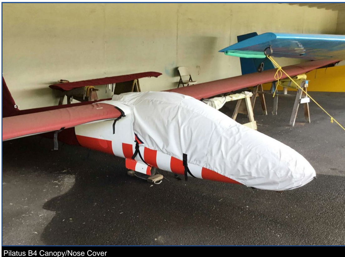
Pilatus B4 Canopy/Nose Cover