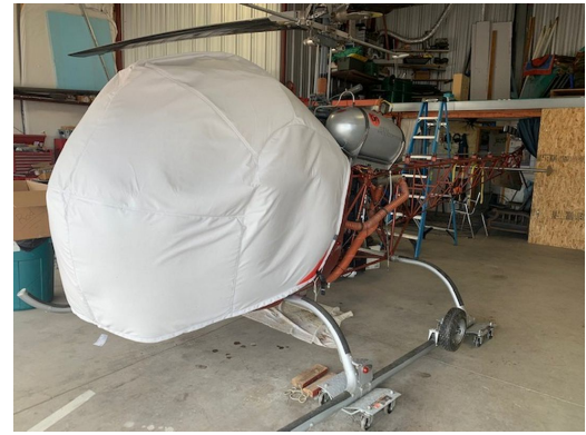
Bell 47 Bubble Cover, Narrow Cabin