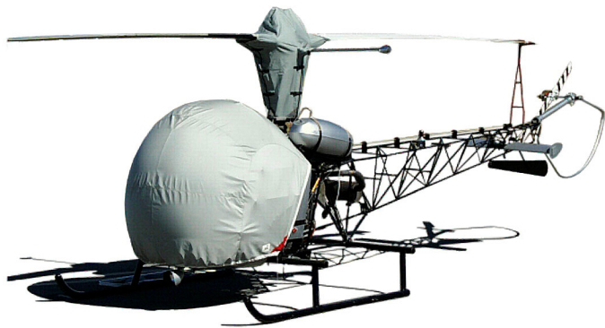
Bubble and Main Rotor Mast Covers

WINTER USE MATERIAL - Made with Solution-Dyed Polyester fabric, this option is intended for seasonal use to aid in deicing, rain mitigation, or for occasional travel. The material is lighter and more compact, but more susceptible to UV damage and may have a shorter useful life if used continuously outside than the all-year use material.