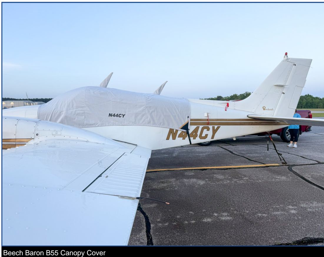
Beech Baron B55 Canopy Cover