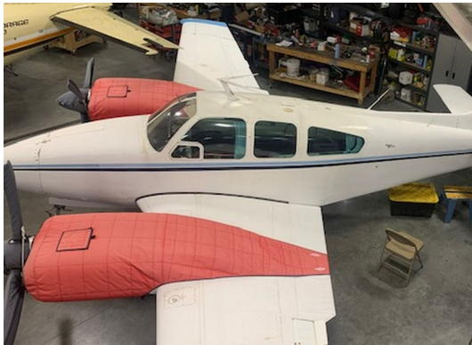
Beech Baron B55 Insulated Engine Covers

This cover type is made from Silver Acrylic Sunbrella canvas and is 100% lined with a soft and smooth microfiber. Bruce's Custom Covers developed this material combination especially for aircraft protection. The outer material is medium weight and treated for water resistance, UV resistance and anti-static buildup. The inner lining is a very soft and smooth microfiber to prevent scratching. The material is very reflective, and tests show that the cabin interior temperature can be reduced to near-ambient temperature on the hottest of days. It is water, ice and snow repellent, yet breathable to allow moisture to escape from between the cover and the aircraft surface.