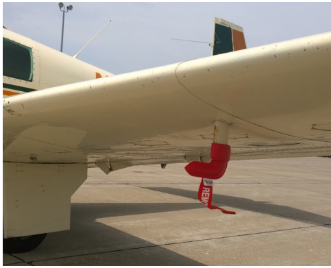
Mooney Pitot Cover