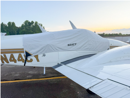
Beech Baron B55 Canopy Cover