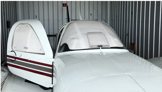
Beech Baron 58P Cockpit Heatshield Set