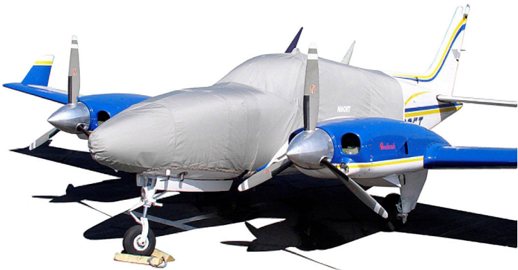
Baron Canopy/Nose Cover