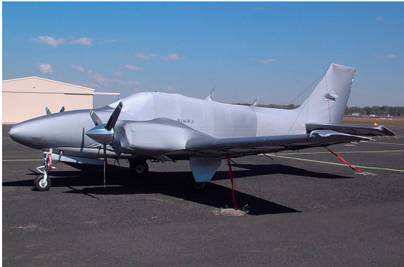
Baron FULL COVER SET, Light Weight Travel &/or Fitted Dust Cover Set

water resistance, UV resistance and anti-static buildup. The inner lining is a very soft and smooth microfiber to prevent scratching. The material is very reflective, and tests show that the cabin interior temperature can be reduced to near-ambient temperature on the hottest of days. It is water, ice and snow repellent, yet breathable to allow moisture to escape from between the cover and the aircraft surface.