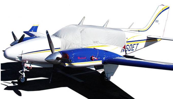
Standard Canopy Cover & Engine Plugs

Travel Covers are made with Silver Solution-Dyed Polyester fabric and only lined over the windshield to save weight. The material is lightweight and more compact for easy stowage in the aircraft. The polyester material is water resistant, but only intended for occasional use outside. We also have an ultra lightweight material available for fitted hangar dust covers. For daily outdoor use, the non-travel Sunbrella Cover is the best choice.