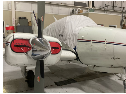
Beech Travel Air Engine Plugs