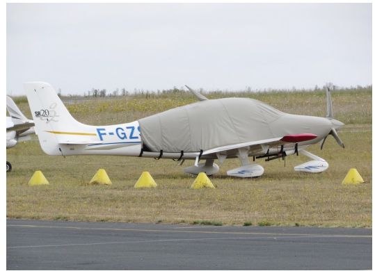
Cirrus SR-22 Extended Canopy/Engine Cover, Prop Cover, Wingtip Pads