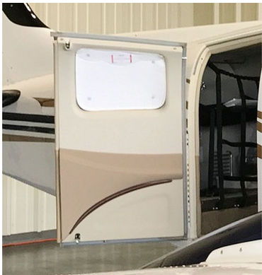
Beech Baron 58 Cabin HeatShield

Windshield Heatshields are interior sunshades for an aircraft's front windshield. The product is a unique composite of closed-cell foam with a silver mylar finish. The semi-rigid design is stiff enough to stand along the inside of the windshield using sun visors or window framing. It folds up flat and easily stores in the included storage sleeve. Some designs may require velcro and suction cups or split right and left sides. A Heatshield is an excellent short-term remedy for cockpit overheating. An external fabric cover is far more effective and practical for long-term protection.