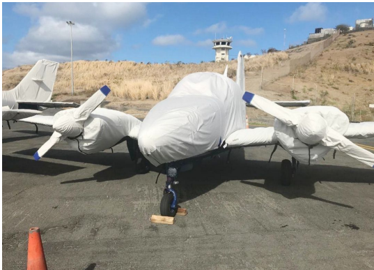
Beech Travel Air Full Cover Set

WINTER USE MATERIAL - Made with Solution-Dyed Polyester fabric, this option is intended for seasonal use to aid in deicing, rain mitigation, or for occasional travel. The material is lighter and more compact, but more susceptible to UV damage and may have a shorter useful life if used continuously outside than the all-year use material.