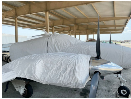
Full Cover Set (58P-020, 58P-225, 58P-405) Beech Baron 58P Extended Canopy/Nose Cover, Wing/Engine Covers (test fit)