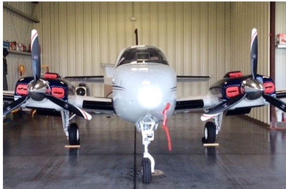
Beech Baron 58 Engine Inlet Plugs, Cowl Top Plugs, Heater Inlet, Pitot Cover