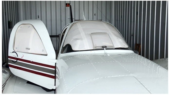
Beech Baron 58P Cockpit Heatshield Set