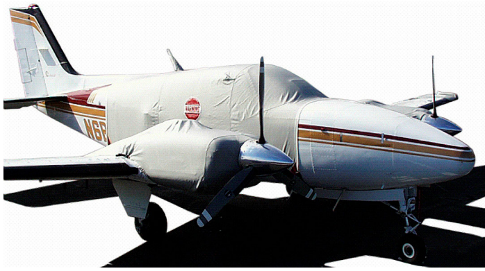
Standard Canopy Cover & Engine Plugs. Extended Canopy Cover & Engine Cover