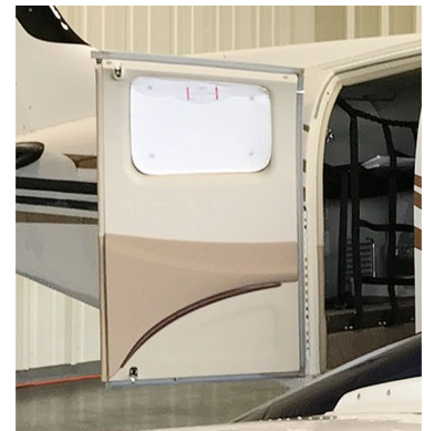
Beech Baron 58 Cabin HeatShield