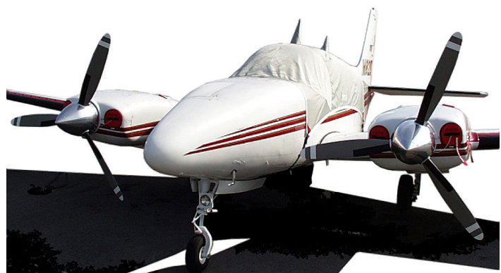
Baron 58 Standard Canopy Cover & Engine Plugs