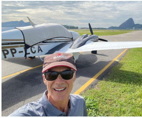
Beech G58 Baron Canopy Cover