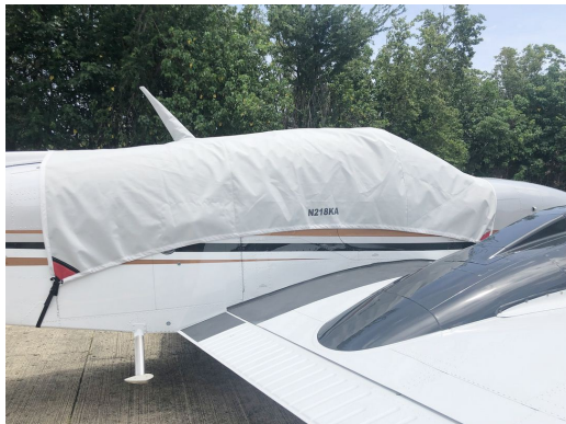
Baron G58 Travel Cover

Travel Covers are made with Silver Solution-Dyed Polyester fabric and only lined over the windshield to save weight. The material is lightweight and more compact for easy stowage in the aircraft. The polyester material is water resistant, but only intended for occasional use outside. We also have an ultra lightweight material available for fitted hangar dust covers. For daily outdoor use, the non-travel Sunbrella Cover is the best choice.