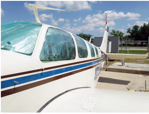
Beech Bonanza Heatshield Set