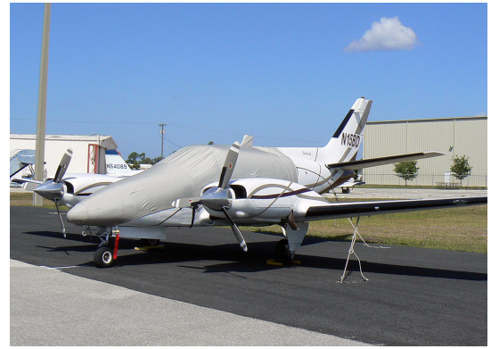
Beech Duke Canopy/Nose Cover