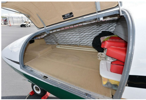
Beech Duke Engine Inlet Plugs stowed in the nose.