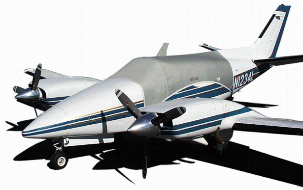
Beech Duke Standard Canopy Cover