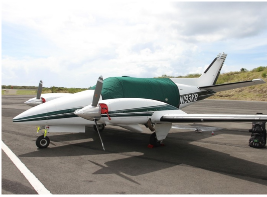
Beech Duke Canopy Cover, Engine Plugs