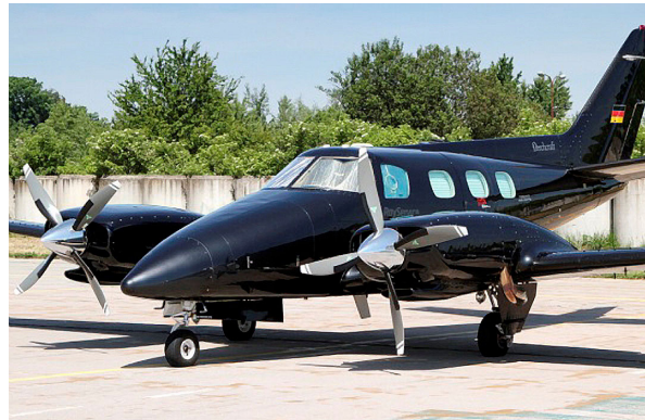
Beech Duke Cockpit HeatShields

Windshield Heatshields are interior sunshades for an aircraft's front windshield. The product is a unique composite of closed-cell foam with a silver mylar finish. The semi-rigid design is stiff enough to stand along the inside of the windshield using sun visors or window framing. It folds up flat and easily stores in the included storage sleeve. Some designs may require velcro and suction cups or split right and left sides. A Heatshield is an excellent short-term remedy for cockpit overheating. An external fabric cover is far more effective and practical for long-term protection.