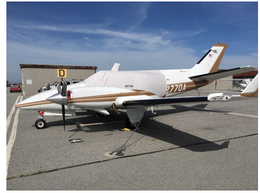
Beech Duke Canopy Cover, Engine Plugs, Pitot Covers