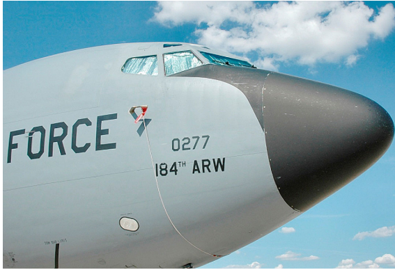
KC-135 Cockpit HeatShields

Blocks, Engine Blocks, and Engine Bungs.