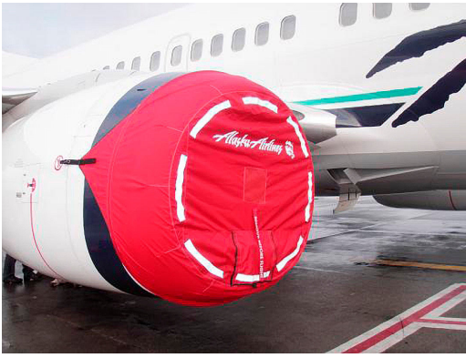
Boeing 737 FOD protection Intake Plug, folding type