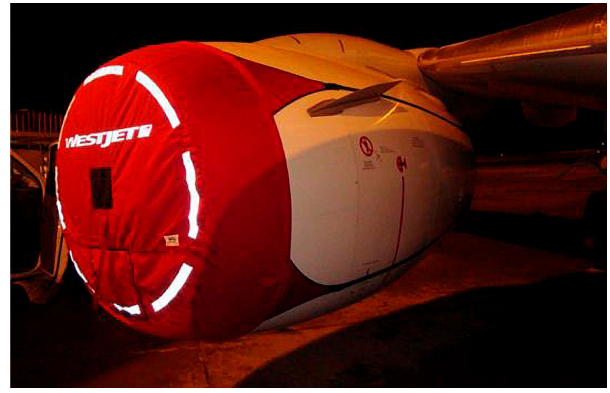
Boeing 737 CFM-56 Universal-fit Classic & NG Intake Cover