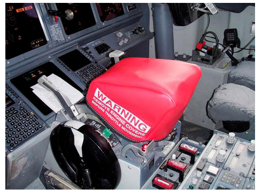
Boeing Throttle Quadrant Cover