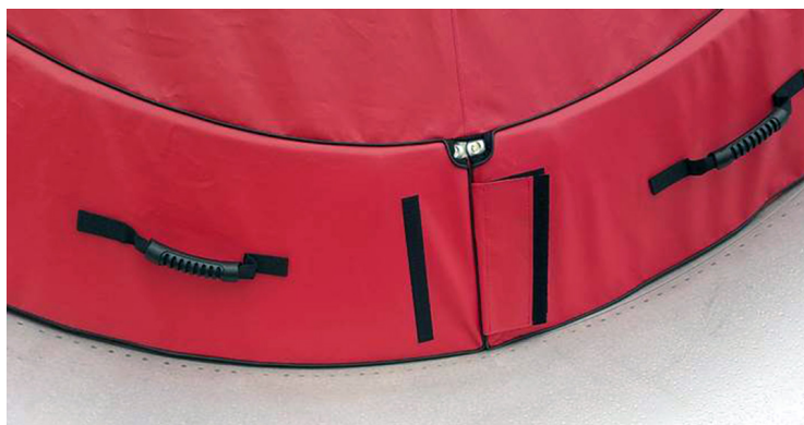
Boeing 747 Intake Plugs, Genx Engines, Framed Bi-Fold Type