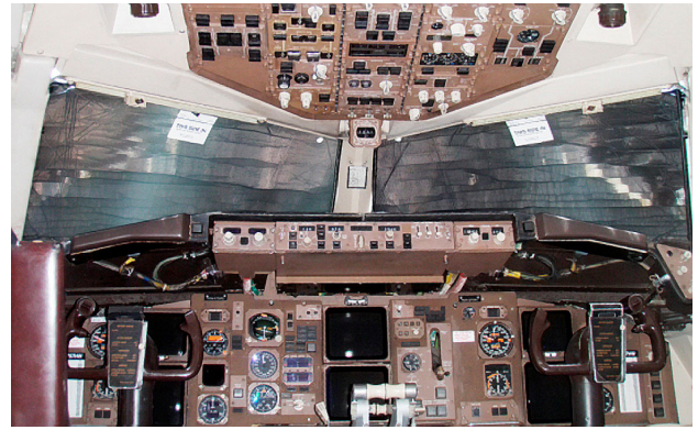
Boeing 757 Cockpit HeatShield set