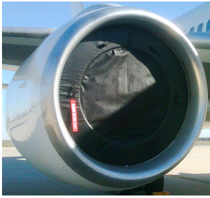
Boeing 757 Intake Plugs, RB.211 Engine (Comes in colors)