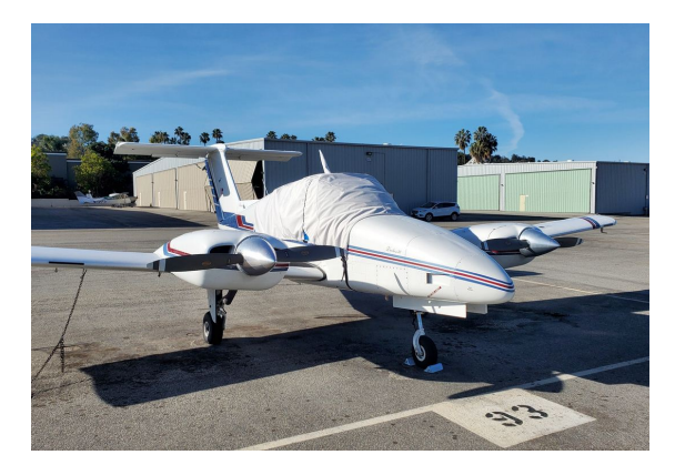
Beech Duchess Canopy Cover

This cover type is made from Silver Acrylic Sunbrella canvas and is 100% lined with a soft and smooth microfiber. Bruce's Custom Covers developed this material combination especially for aircraft protection. The outer material is medium weight and treated for water resistance, UV resistance and anti-static buildup. The inner lining is a very soft and smooth microfiber to prevent scratching. The material is very reflective, and tests show that the cabin interior temperature can be reduced to near-ambient temperature on the hottest of days. It is water, ice and snow repellent, yet breathable to allow moisture to escape from between the cover and the aircraft surface.