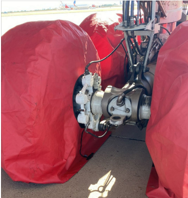
Boeing 777 Main Gear Tire Covers

ALL-YEAR USE MATERIAL - Made with Silver Acrylic Sunbrella canvas, the all-year use material is the best option for sun protection and cover longevity. This heavier more durable material is intended for all weather conditions, such as rain and snow or lots of sun.