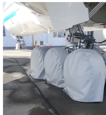
Boeing 777 Main & Nose Gear Tire Covers