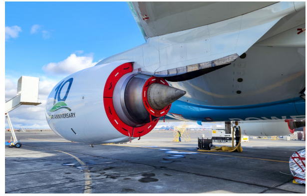
Boeing 777 Bypass Vent & Exhaust Plugs