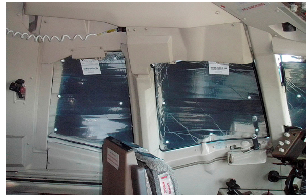
Boeing 767 Cockpit HeatShield set