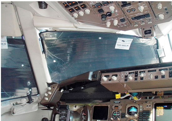
Boeing 767 Cockpit HeatShield set

Cockpit Heatshields are interior sunshades for the aircraft's cockpit. The product is a unique composite of closed-cell foam with a silver mylar finish. The semi-rigid design is stiff enough to stand inside the window framing. The set folds up flat and is easily stored in the included storage sleeve. Some designs may require velcro and suction cups. Our Heatshields for jets are offered white side out because some aircraft manufacturers have issued advisories against reflective window inserts due to potential heat damage. A Heatshield is an excellent short-term remedy for cockpit overheating, but an external fabric cover is more effective for long-term protection.