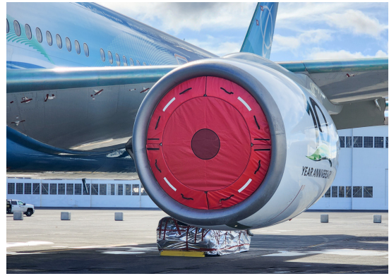
Boeing 777 Intake Plugs, framed, Bi-fold design.