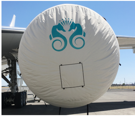
Boeing 777 Intake Covers, GE Engine