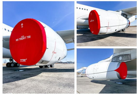
Boeing 777 Intake Covers, GE Engine