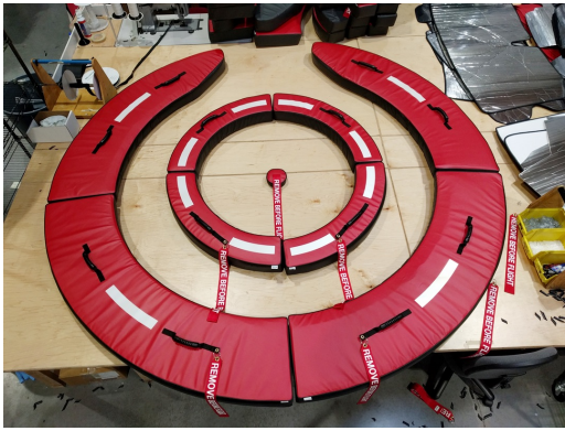
Boeing 747-8 Exhaust Plugs