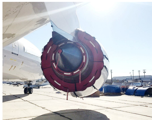
Boeing 787 Dreamliner Bypass Vent, Turbine Exhaust, & Exhaust Nozzle Plugs, Genx Engines