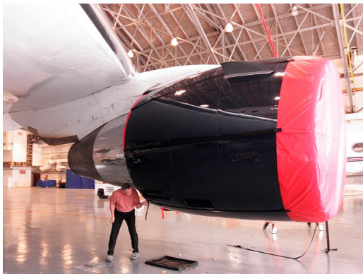
Boeing 767 Intake Covers Ship Set