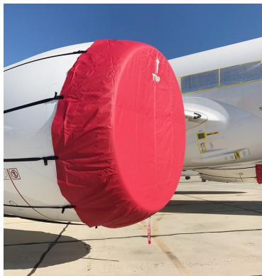
Boeing 787 Dreamliner Intake Covers Kit, Oem Type, Each, Boeing P/N: K10011-1 (Equals Qty 2 Of K10011-2), Adjustable Straps To Bypass Attachment Detail