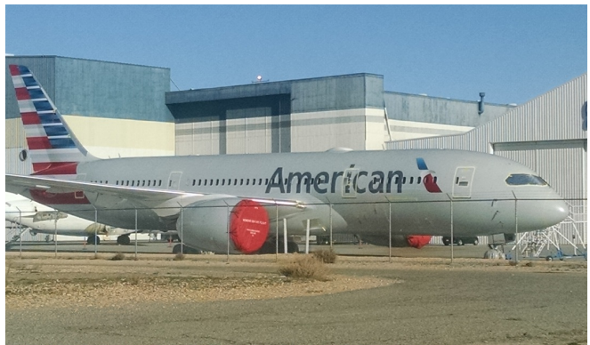
Boeing 787 Intake Covers