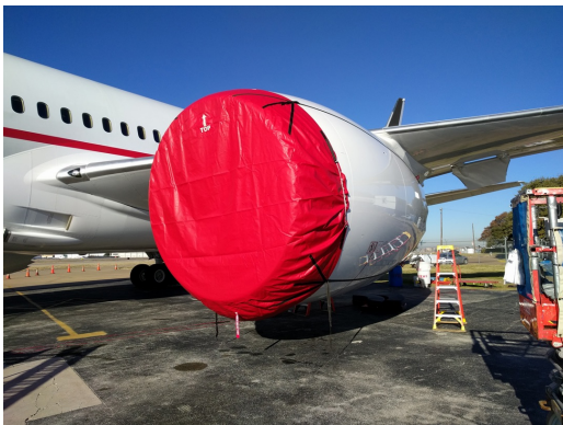
Boeing 787 Intake Cover