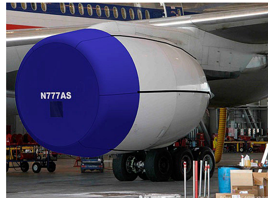
Boeing 777 Intake Cover, GE Engine