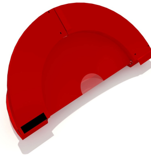
Airbus A330 Intake Plug, framed bi-fold type