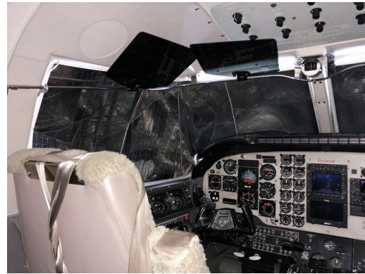
Beech King Air 90 & 100 (U-21, RU-21, T-44) Cockpit Heatshields