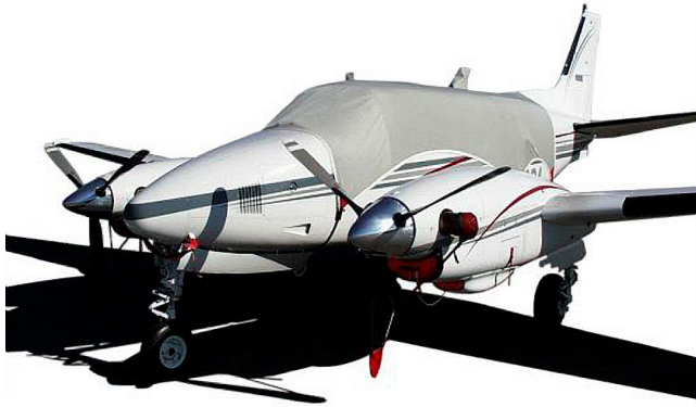
King Air Canopy Cover, Engine Plugs, Prop-Tie/Exhaust Covers

Travel Covers are made with Silver Solution-Dyed Polyester fabric and only lined over the windshield to save weight. The material is lightweight and more compact for easy stowage in the aircraft. The polyester material is water resistant, but only intended for occasional use outside. We also have an ultra lightweight material available for fitted hangar dust covers. For daily outdoor use, the non-travel Sunbrella Cover is the best choice.