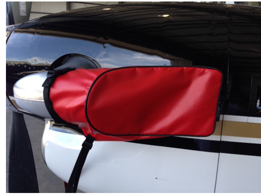
King Air Exhaust Stack Cover