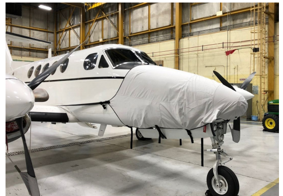
King Air 200 Nose Cover