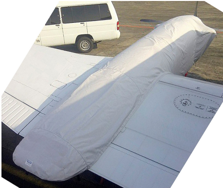
King Air 350 Engine Cover

ALL-YEAR USE MATERIAL - Made with Silver Acrylic Sunbrella canvas, the all-year use material is the best option for sun protection and cover longevity. This heavier more durable material is intended for all weather conditions, such as rain and snow or lots of sun.