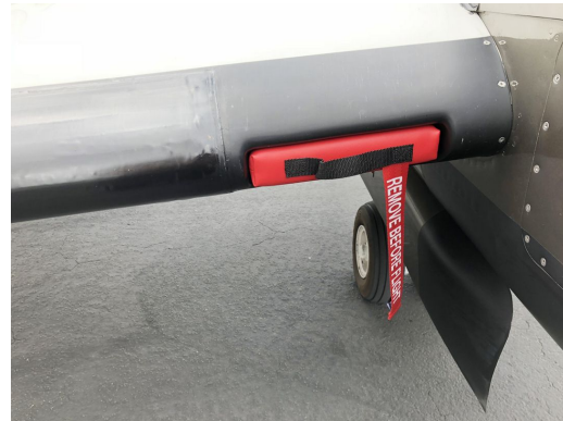
Beech King Air Heat Exchanger Inlet Plug