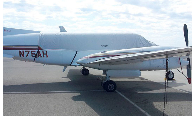
King Air 350 Canopy Cover