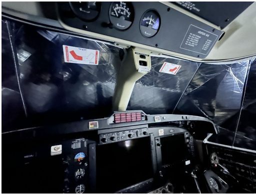
Beechcraft B200 Cockpit Heatshields

Cockpit Heatshields are interior sunshades for the aircraft's cockpit. The product is a unique composite of closed-cell foam with a silver mylar finish. The semi-rigid design is stiff enough to stand inside the window framing. The set folds up flat and is easily stored in the included storage sleeve. Some designs may require velcro and suction cups. A Heatshield is an excellent short-term remedy for cockpit overheating, but an external fabric cover is more effective for long-term protection.