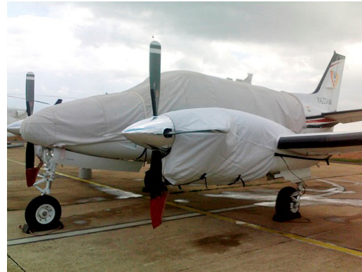
King Air C90 Canopy/Nose Cover, Engine Covers