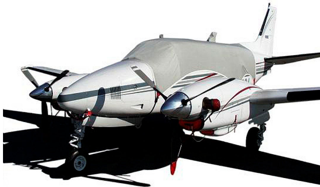
King Air Canopy Cover, Engine Plugs, Prop-Tie/Exhaust Covers

This cover type is made from Silver Acrylic Sunbrella canvas and is 100% lined with a soft and smooth microfiber. Bruce's Custom Covers developed this material combination especially for aircraft protection. The outer material is medium weight and treated for water resistance, UV resistance and anti-static buildup. The inner lining is a very soft and smooth microfiber to prevent scratching. The material is very reflective, and tests show that the cabin interior temperature can be reduced to near-ambient temperature on the hottest of days. It is water, ice and snow repellent, yet breathable to allow moisture to escape from between the cover and the aircraft surface.