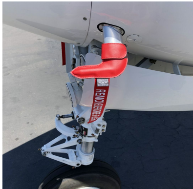
Beech King Air Pitot Covers

Engine Inlet Plugs are custom fit for your Beech King Air C90-1 intakes, made with heavy-duty vinyl material, and stuffed with a single block of sculpted urethane foam. Each plug has a zipper that allows the foam to be removed and dried if necessary. Engine plugs have warning flags that are visible from the cockpit or 'remove before flight' streamers sewn onto the face of the plugs. Most plugs are imprinted with the aircraft registration number in black for an extra charge. Storage bag NOT included. Engine plugs may be inserted after flight when the engine is still warm. Engine Inlet Plugs are commonly referred to as Cowl Plugs, Intake Plugs, Cowl Blocks, Engine Blocks, and Engine Bungs.