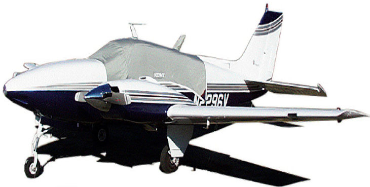
Beech Baron Canopy Cover