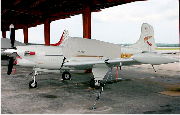
Beech B95 Travel Air Canopy Cover (Turbine Model)

Canopy Covers are commonly referred to as Cabin Covers, Fuselage Covers, Canvas Covers, Canopy Caps, etc.