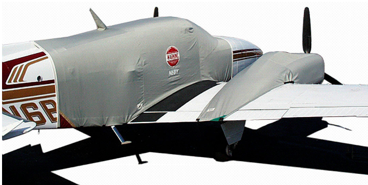
Baron Extended Canopy Cover & Engine Covers

This cover type is made from Silver Acrylic Sunbrella canvas and is 100% lined with a soft and smooth microfiber. Bruce's Custom Covers developed this material combination especially for aircraft protection. The outer material is medium weight and treated for water resistance, UV resistance and anti-static buildup. The inner lining is a very soft and smooth microfiber to prevent scratching. The material is very reflective, and tests show that the cabin interior temperature can be reduced to near-ambient temperature on the hottest of days. It is water, ice and snow repellent, yet breathable to allow moisture to escape from between the cover and the aircraft surface.