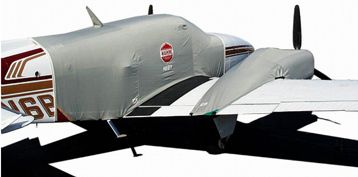
Baron Extended Canopy Cover & Engine Covers

This cover type is made from Silver Acrylic Sunbrella canvas and is 100% lined with a soft and smooth microfiber. Bruce's Custom Covers developed this material combination especially for aircraft protection. The outer material is medium weight and treated for water resistance, UV resistance and anti-static buildup. The inner lining is a very soft and smooth microfiber to prevent scratching. The material is very reflective, and tests show that the cabin interior temperature can be reduced to near-ambient temperature on the hottest of days. It is water, ice and snow repellent, yet breathable to allow moisture to escape from between the cover and the aircraft surface.