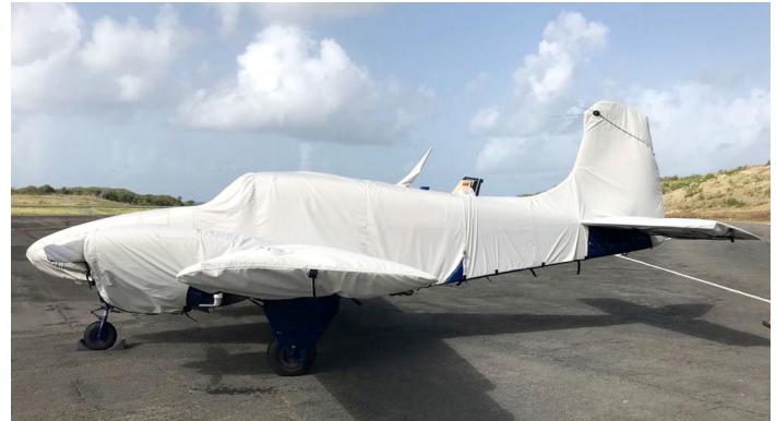
Standard Canopy Cover & Engine Plugs. Extended Canopy Cover & Engine Cover