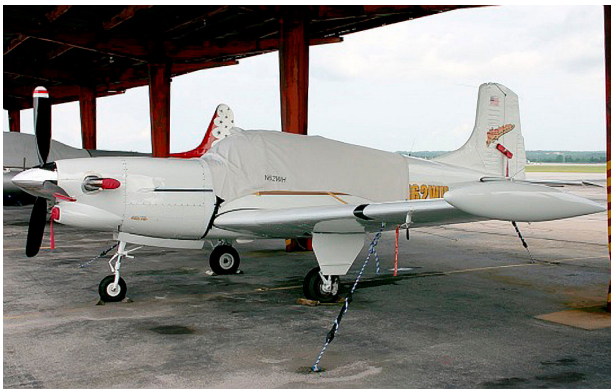
Beech B95 Travel Air Canopy Cover (Turbine Model)

Canopy Covers are commonly referred to as Cabin Covers, Fuselage Covers, Canvas Covers, Canopy Caps, etc.