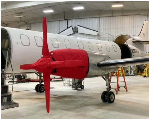
Fairchild Merlin Insulated Engine & Prop Covers