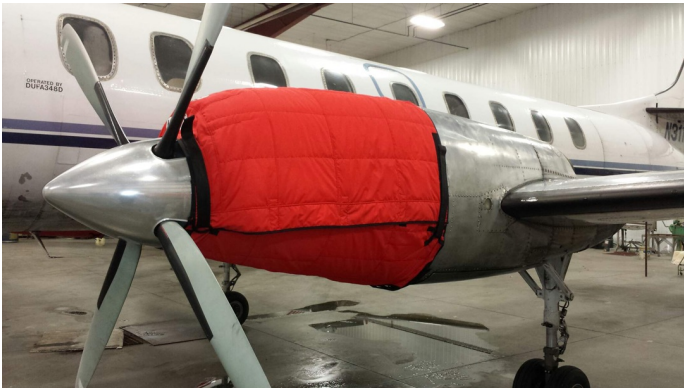
Merlin Insulated Engine Covers

This cover type is made from Silver Acrylic Sunbrella canvas and is 100% lined with a soft and smooth microfiber. Bruce's Custom Covers developed this material combination especially for aircraft protection. The outer material is medium weight and treated for water resistance, UV resistance and anti-static buildup. The inner lining is a very soft and smooth microfiber to prevent scratching. The material is very reflective, and tests show that the cabin interior temperature can be reduced to near-ambient temperature on the hottest of days. It is water, ice and snow repellent, yet breathable to allow moisture to escape from between the cover and the aircraft surface.