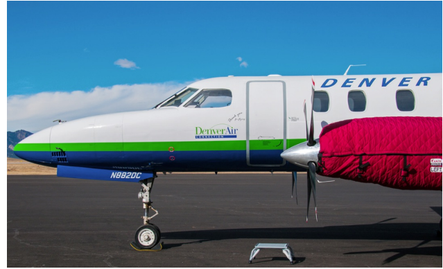
Merlin Insulated Engine Covers