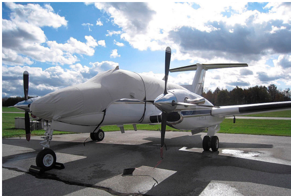
King Air B200 Canopy/Nose Cover

This cover type is made from Silver Acrylic Sunbrella canvas and is 100% lined with a soft and smooth microfiber. Bruce's Custom Covers developed this material combination especially for aircraft protection. The outer material is medium weight and treated for water resistance, UV resistance and anti-static buildup. The inner lining is a very soft and smooth microfiber to prevent scratching. The material is very reflective, and tests show that the cabin interior temperature can be reduced to near-ambient temperature on the hottest of days. It is water, ice and snow repellent, yet breathable to allow moisture to escape from between the cover and the aircraft surface.