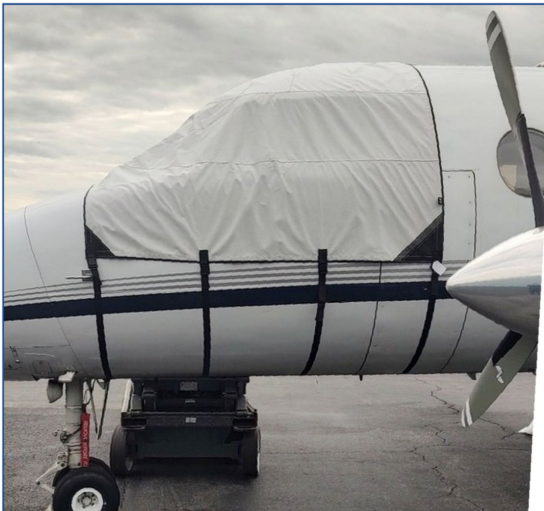
British Aerospace Jetstream 31 Cockpit Cover