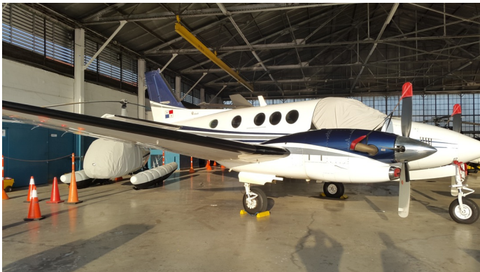
British Aerospace Jetstream 31 Cockpit Cover Raytheon Beech King Air Cockpit Cover, Prop Tie/Exhaust Covers, Inlet Plugs