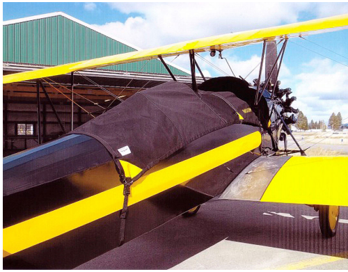
Stearman C3 Canopy Cover