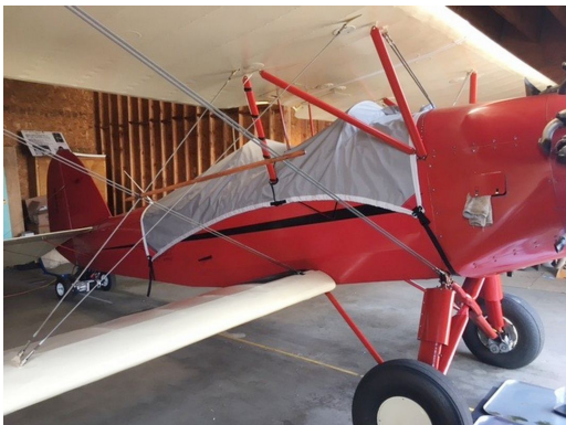
Bird BK Travel Canopy Cover

Travel Covers are made with Silver Solution-Dyed Polyester fabric and only lined over the windshield to save weight. The material is lightweight and more compact for easy stowage in the aircraft. The polyester material is water resistant, but only intended for occasional use outside. We also have an ultra lightweight material available for fitted hangar dust covers. For daily outdoor use, the non-travel Sunbrella Cover is the best choice.