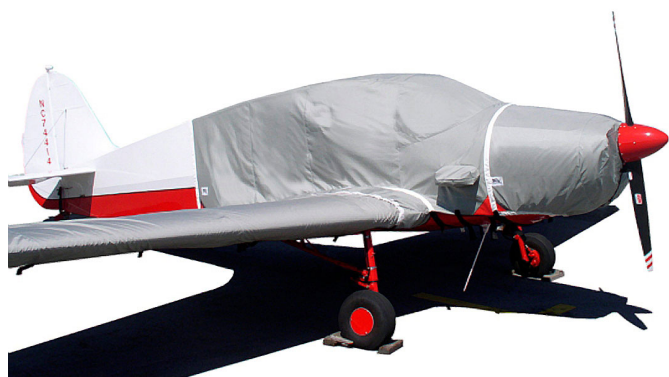
Extended Canopy Cover w/12" Wing Extensions, Engine & Wing Covers

This cover type is made from Silver Acrylic Sunbrella canvas and is 100% lined with a soft and smooth microfiber. Bruce's Custom Covers developed this material combination especially for aircraft protection. The outer material is medium weight and treated for water resistance, UV resistance and anti-static buildup. The inner lining is a very soft and smooth microfiber to prevent scratching. The material is very reflective, and tests show that the cabin interior temperature can be reduced to near-ambient temperature on the hottest of days. It is water, ice and snow repellent, yet breathable to allow moisture to escape from between the cover and the aircraft surface.