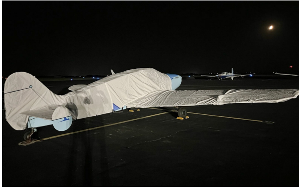
Bellanca Cruisemaster Cover Set

This cover type is made from Silver Acrylic Sunbrella canvas and is 100% lined with a soft and smooth microfiber. Bruce's Custom Covers developed this material combination especially for aircraft protection. The outer material is medium weight and treated for water resistance, UV resistance and anti-static buildup. The inner lining is a very soft and smooth microfiber to prevent scratching. The material is very reflective, and tests show that the cabin interior temperature can be reduced to near-ambient temperature on the hottest of days. It is water, ice and snow repellent, yet breathable to allow moisture to escape from between the cover and the aircraft surface.