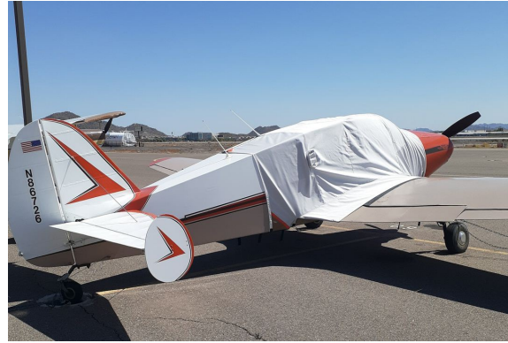
Bellanca 14-13 Cruisair Extended Canopy Cover w/12" Wing Extensions