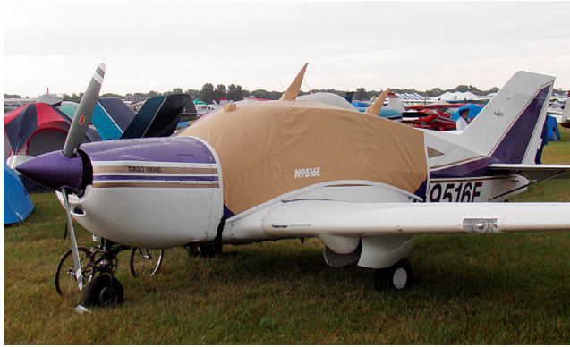
Bellanca Viking Canopy Cover

This cover type is made from Silver Acrylic Sunbrella canvas and is 100% lined with a soft and smooth microfiber. Bruce's Custom Covers developed this material combination especially for aircraft protection. The outer material is medium weight and treated for water resistance, UV resistance and anti-static buildup. The inner lining is a very soft and smooth microfiber to prevent scratching. The material is very reflective, and tests show that the cabin interior temperature can be reduced to near-ambient temperature on the hottest of days. It is water, ice and snow repellent, yet breathable to allow moisture to escape from between the cover and the aircraft surface.