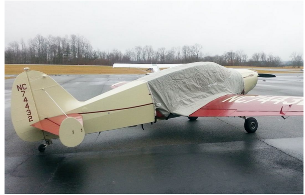
Bellanca Cruisemaster Extended Canopy Cover