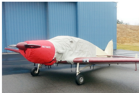
Bellanca Cruisemaster Insulated Engine Cover, Extended Canopy Cover